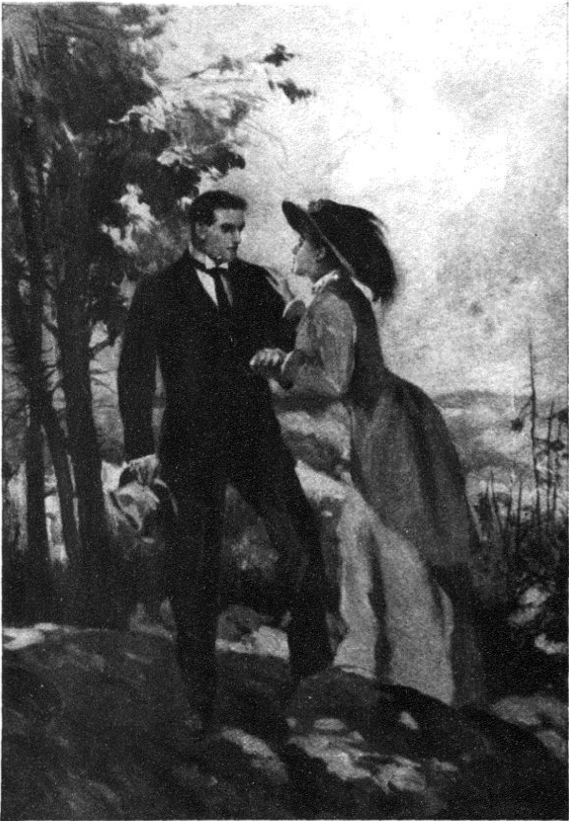
"Nan looked at him in despair"