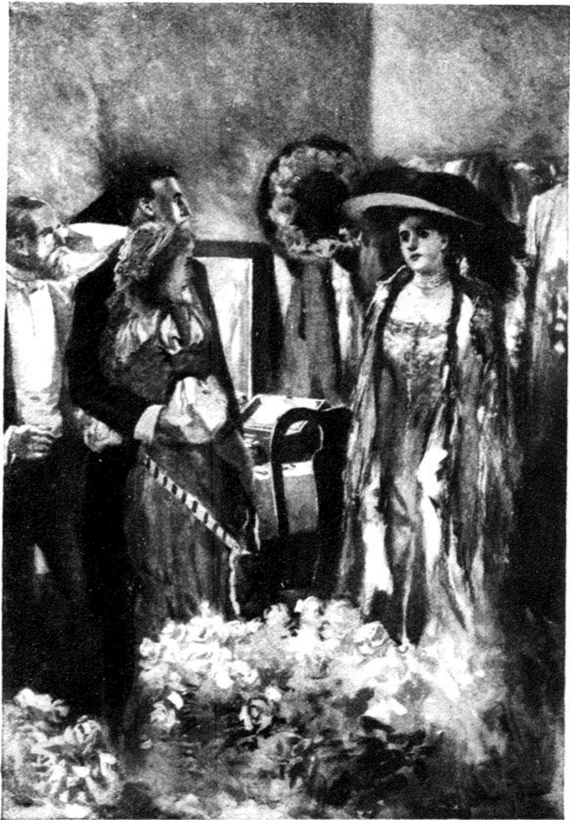
"He turned and saw Nan"