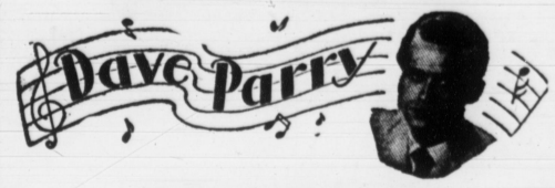
His Piano and His Orchestra