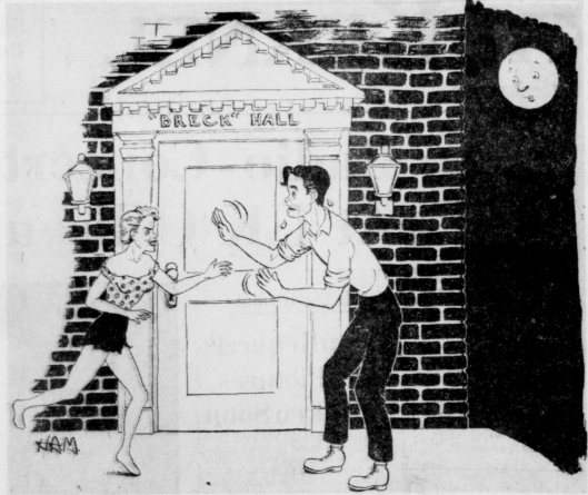
"But I've already got a roommate!"

Any organization may reserve the pool for Splash Parties on Friday night with the payment of a ten dollar fee. Swimming privilege cards are not required for Splash Parties, but all participants must have health certificates.