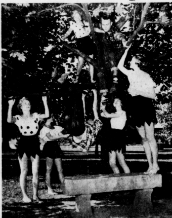
THEY DON'T TREAD 'EM! These girls couldn't wait for the Sadie Hawkins Day race, they got busy ahead of time. But the remaining body of the UK femininity will have their chance this afternoon on the Intramural field. At 4 p.m. the whole show.

DANCE-ORGERS MAY vote for their choice for Lf Abner, and Daisy Mae using dance tickets as ballots. The votes shall be cast by writing the name of one Lf Abner and one Daisy Mae on the back of each ticket. Mr. Lf Abner and Miss Daisy Mae of 1950 will be presented during the dance.