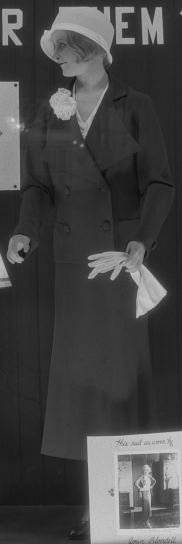
Her hat as seen in "The Greeks Had A Word For Them"