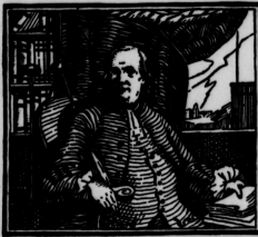
BENJAMIN FRANKLIN 1706-1790

Printer, journalist, diplomat, inventor, statesman, philosopher, wit. One of the authors of the Declaration of Independence and the Constitution, author of Poor Richard's Almanack; and one of the most eminent natural philosophers of his time.