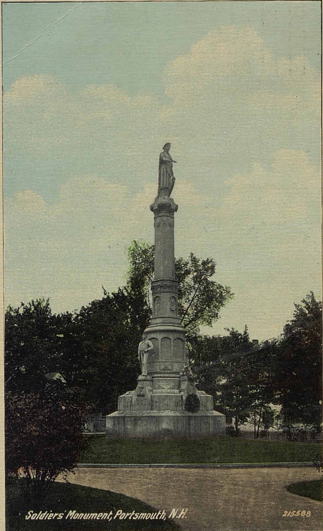
Soldiers' Monument, Portsmouth, N.H.