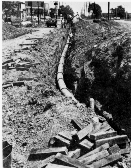
Progress On the Chisholm Trail