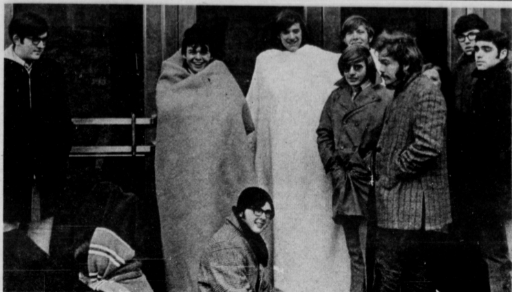
Shiver . . .

To be number one in line for tickets of UK's first home basketball game of the season Saturday night, it meant arriving at Memorial Coliseum's door at 2:30 in the afternoon for these UK students and being prepared for a long, cold wait.