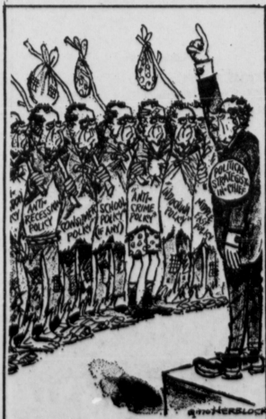
Herb Lubow in The Washington Post

It is admittedly difficult for Americans, reading their morning