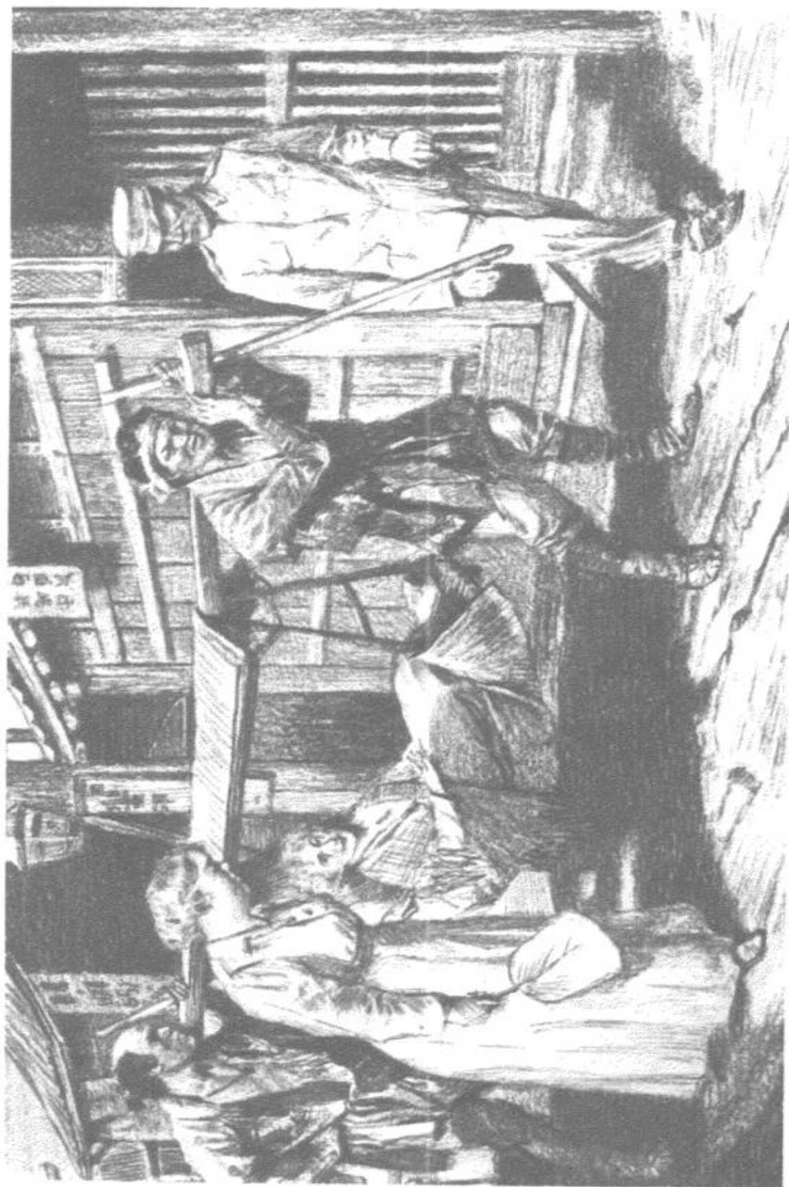
Through the sinister shadows of Flying Sparrow Street