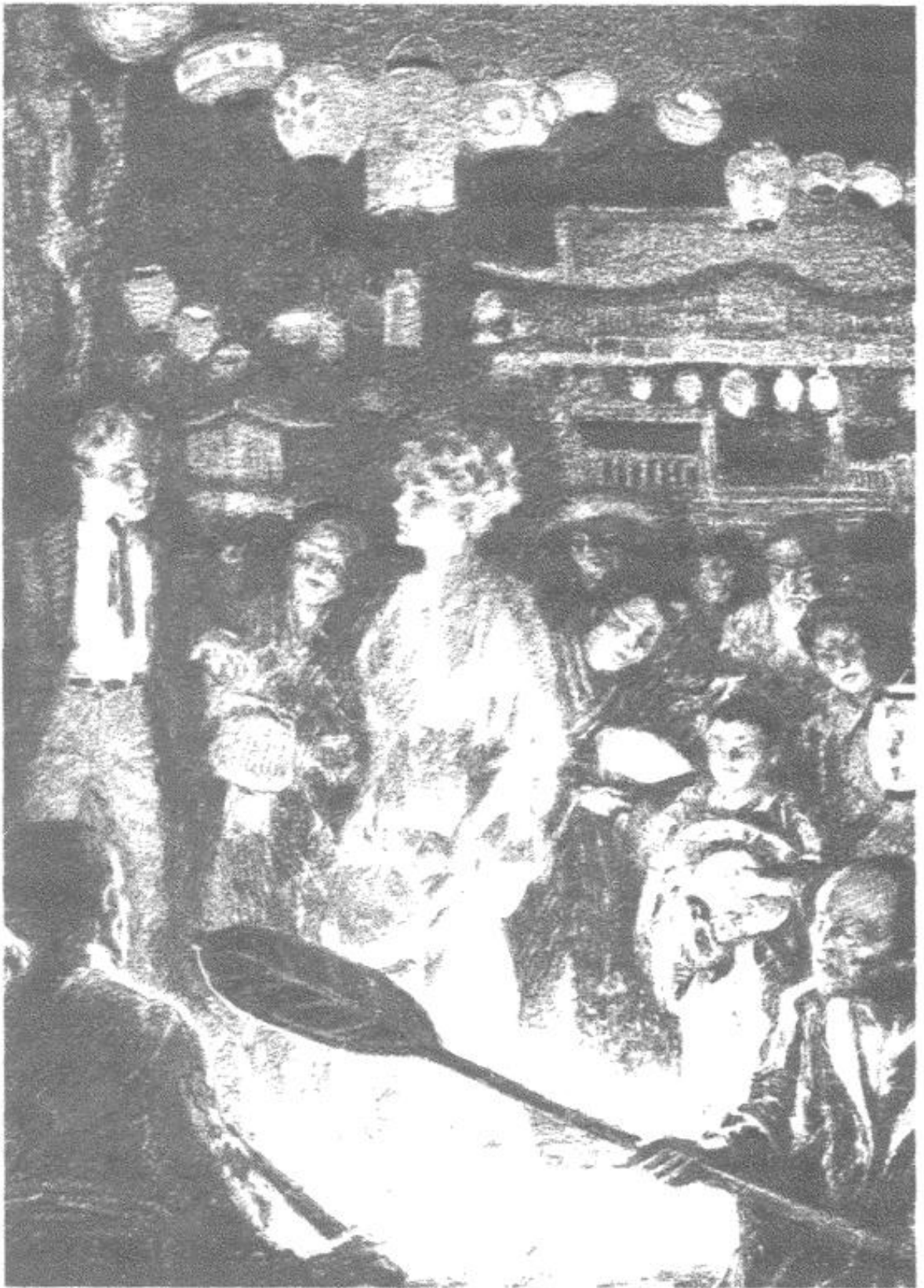
She quickly walked across the burning coal