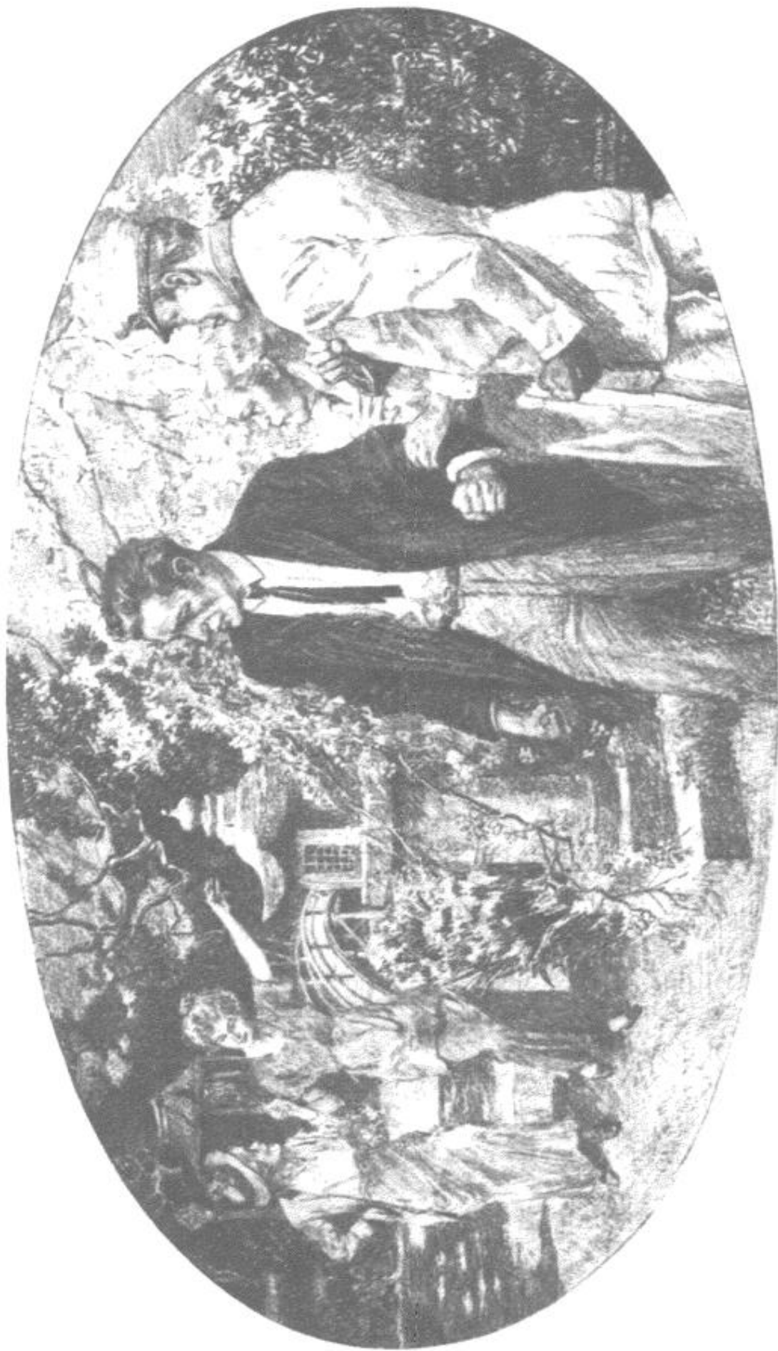
Page started forward. A sound stopped him