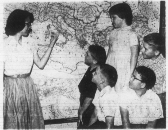
Learning Their Latin

Two classes are being offered this summer. One is a continuation of a course offered during the spring semester which met once a week. This continuation class