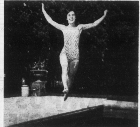
"Last One In Is A . . ."

Officials at the University's Ashland Center have announced an enrollment of 132 students. Northern Center, Covington, enrollment figures have not been announced because registration was not started until Monday.