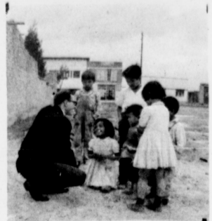
DURING LAST YEAR'S PROJECT

After participants are chosen, an orientation session will be initiated for the