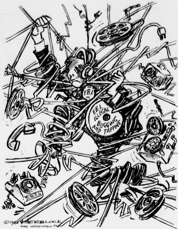
The Tangled Web

While we cannot comment upon the specifics of the report, which will not be released until sometime next month, we heartily endorse the policy statements which guided its drafting, and encourage the University Senate to thoroughly study this important area and to commit itself to recommending a modern student judicial code for the University.