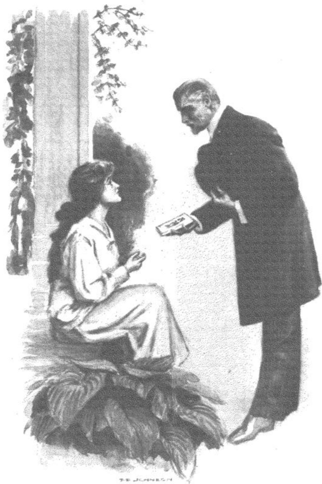
The Colonel handed me the medal