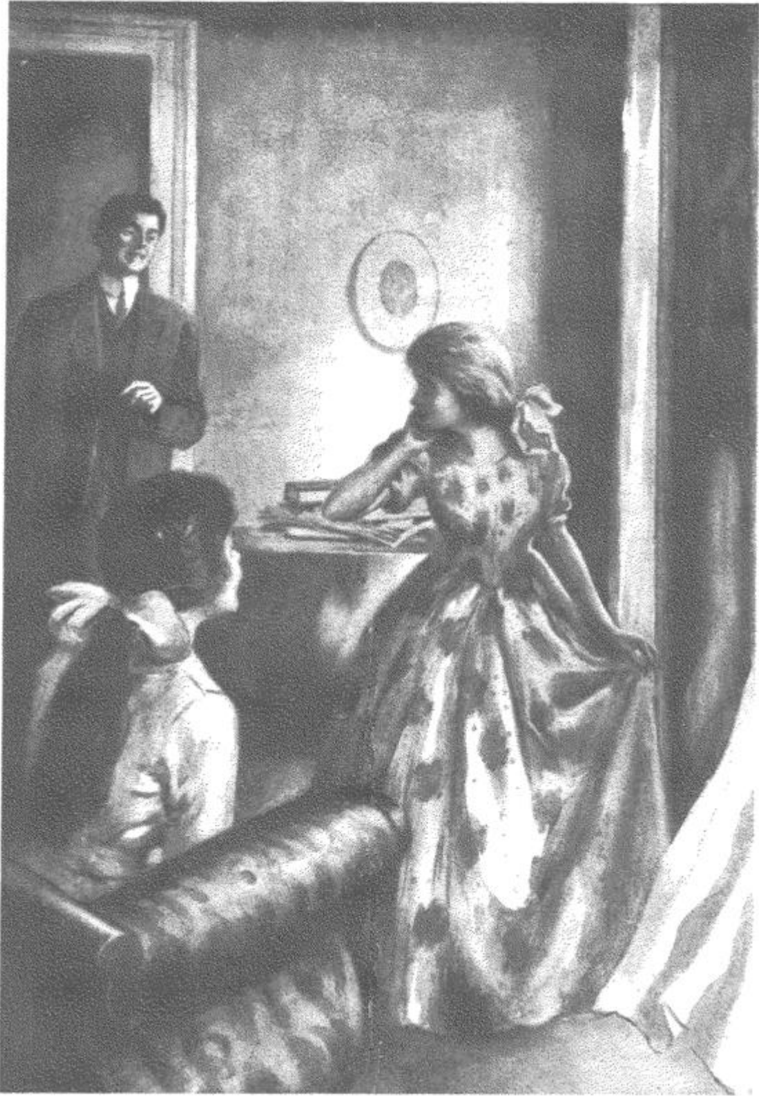
He stood there in the doorway and laughed until his big shoulders shook.