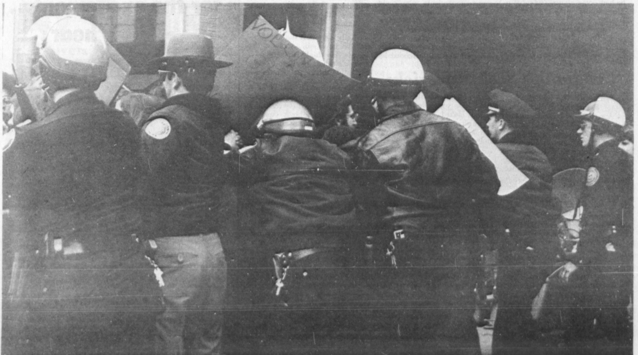
And Her Volunteers