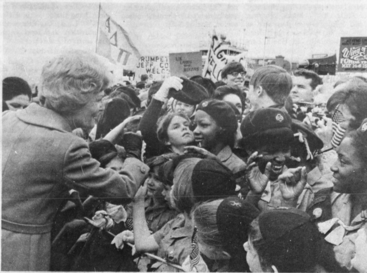
Welcoming Mrs. Nixon at Bluegrass Field, Girl Scouts and Brownies seemed entranced over personally seeing the nation's First Lady. Mrs. Nixon

spoke briefly at the airport Tuesday before beginning the hand-shaking and touring activities planned for the day.