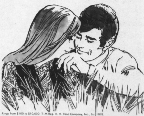
Rings from $100 to $10,000. T-M Reg. A. H. Pond Company, Inc., Est. 1892.