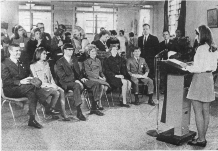
Kernel