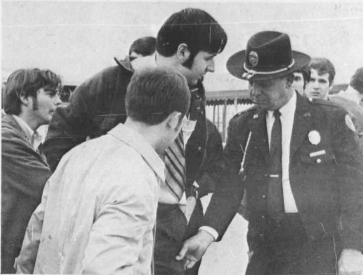
A Fayette County patrolman searches a UK student for a tear gas container which reportedly was used to spray gas onto the faces of several Student Mobilization Committee members during the airport festivities of Mrs. Richard Nixon's Lexington visit. No arrests were made.

Two students were arrested on disorderly conduct charges. One is in the UK Medical Center with unspecified injuries resulting from an encounter with the police.