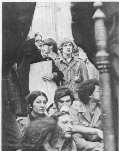
Policemen with night sticks and student protesters with signs greeted Mrs. Nixon as she departed from the Phoenix Hotel, where she and her official party had lunch.

Interviews for the positions will be set up after spring break. The only requirement is that the student applying not be on academic probation.