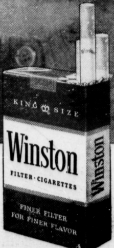
H. J. Reynolds Tobacco Co., Winston-Salem, N. C.

FILTER-BLEND —a Winston exclusive—makes the big taste difference. You get rich tobaccos that are specially selected and specially processed for full flavor in filter smoking. Make your next pack Winston!