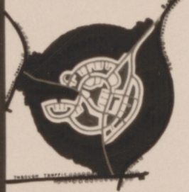
THE NEW WAY