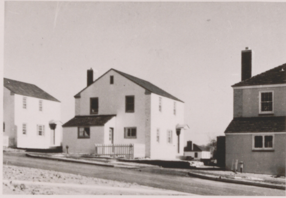
F3-12 HOUSE ON N. CHERRY ST. ILLUS. NO. 36