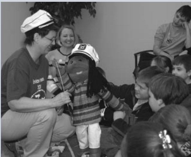
At "Manners Marina," the children learned about good manners and how to respect other people.

The events were sponsored by the Good Samaritan Nursing Center of the College of Nursing and funded by the Good Samaritan Foundation, Inc. The foundation is a Kentucky grant-making public philanthropy devoted to health-related education, health promotion and research.