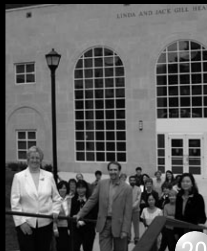
New M.S.N. track