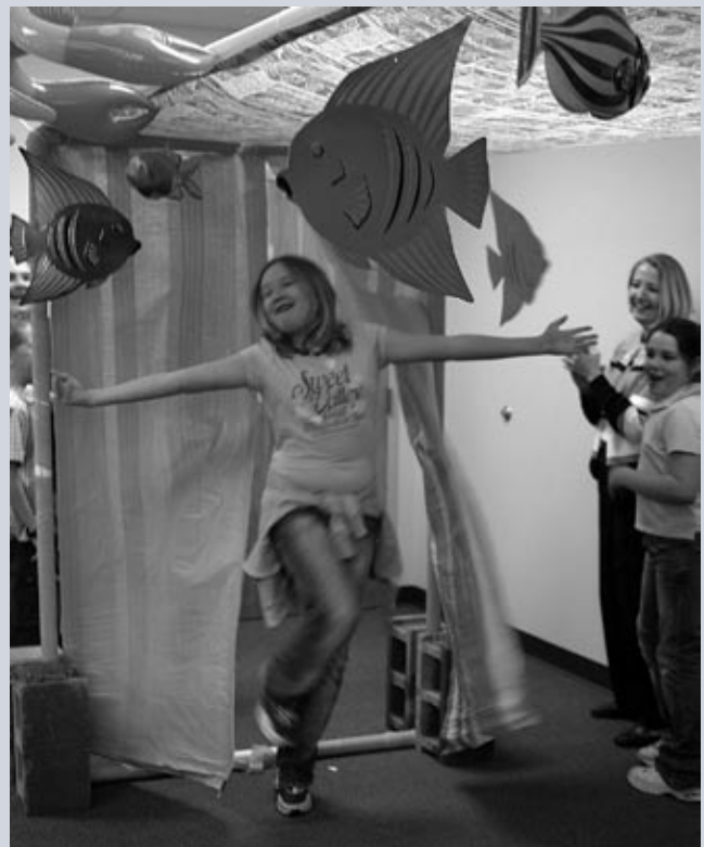
"Self-Esteem Submarine" was a popular place to be. (Kids won't pass up an opportunity to be silly!) During this activity, they learned about self-esteem and how to improve upon their own.