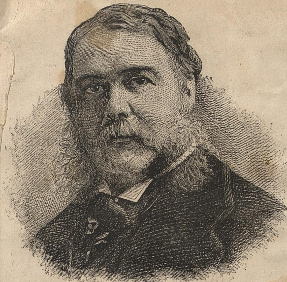
CHESTER A. ARTHUR.

NINETEENTH PRESIDENT. Served four years. In 1876 was nominated for President by the Republicans. His election was so uncertain that an electoral commission was created to decide the contest. They voted 8 to 7 in favor of Mr. Hayes. In the Rebellion was Major of the Twenty-third Ohio Volunteers. Was sent to Congress from Ohio, and was twice Governor of that State.