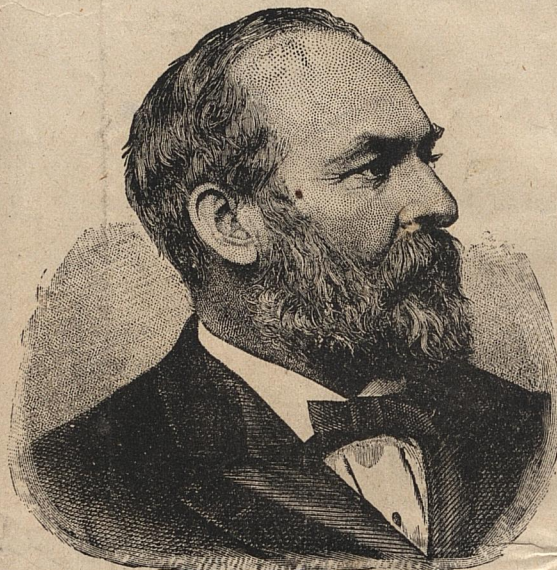
JAMES A. GARFIELD.

EIGHTEENTH PRESIDENT. Served eight years. Was elected to the Presidency on the Republican ticket in 1868, and again in 1872. Born at Point Pleasant, Ohio, April 27, 1822. In 1839 he entered the West Point Military Academy, graduating in 1843. Served on the Missouri frontier, and in General Taylor's Army in the Mexican War. Was a successful General during the Rebellion.