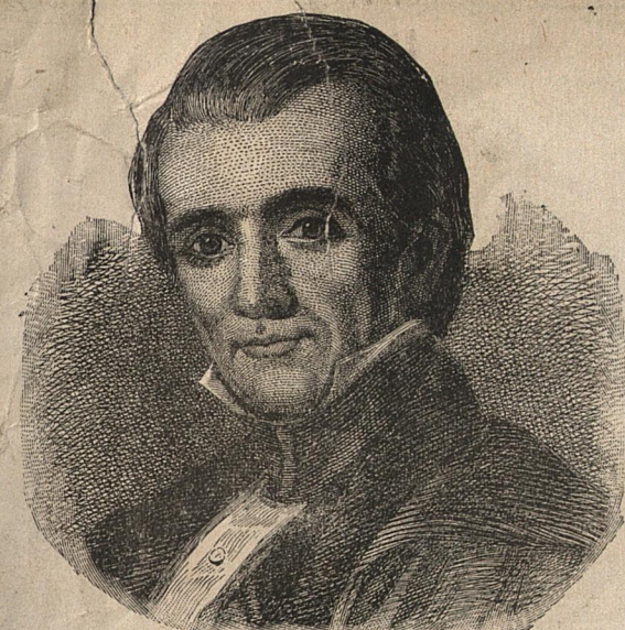
JAMES KNOX POLK.

NINTH PRESIDENT. Served one month. Was elected President on the Whig ticket in 1840, but died one month after his inauguration, April 4, 1841. Was born at Berkeley, Va., February 9, 1773. In the War of 1812, he commanded the Northwestern frontier. In 1816 was elected to Congress, and in 1824, United States Senator. Was sent as Minister to Columbia, S. A., in 1828.