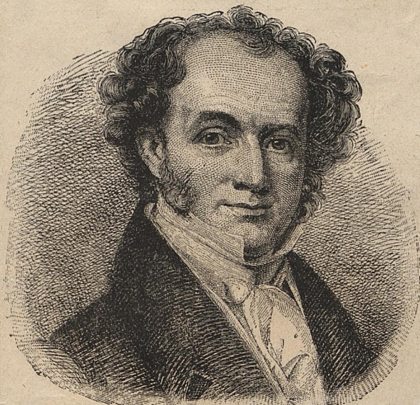
MARTIN VAN BUREN.

ELEVENTH PRESIDENT. Served four years. Elected in 1844 on the Democratic ticket. Born in Mecklenburg County, N. C., November 2, 1795. Died at Nashville, Tenn., June 15, 1849. His administration was distinguished by the war with Mexico, the creation of the Interior Department at Washington, the adoption of low tariff, and other important events. Served in the Legislature, Congress, and as Governor of Tennessee.