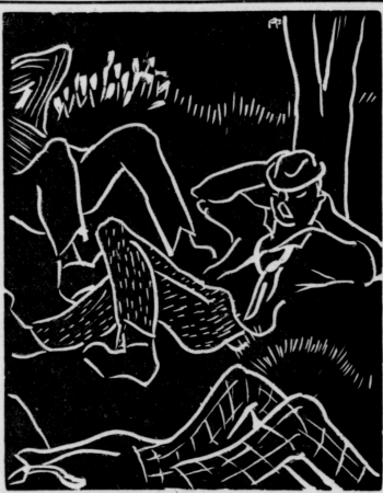
Esprit De Corps

All signed articles and columns are to be considered the opinions of the writers themselves, and do not necessarily reflect the opinion of The Kernel .