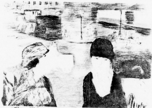
"Place Clichy" by Pierre Bonnard, a lithograph from the Lakeside collection, being shown at the Student Center Thursday.