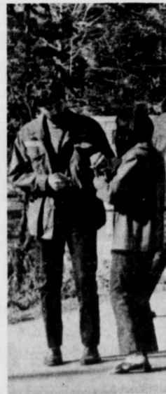
is given $7 cash. In the middle panel, a generous coed puts up the money herself. At right, the driver collects the $7 and gets ready to lower the captive automobile.