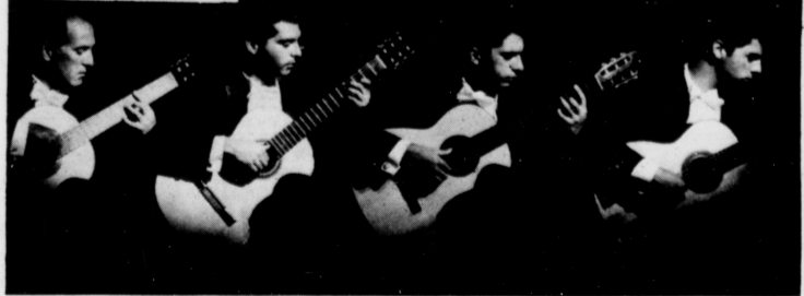
THE ROMEROS. Celedonio, Celin, Pepe and Angel (left to right).

Next on stage was curly-haired Pepe, the Flamenco specialist of the group, and certainly the