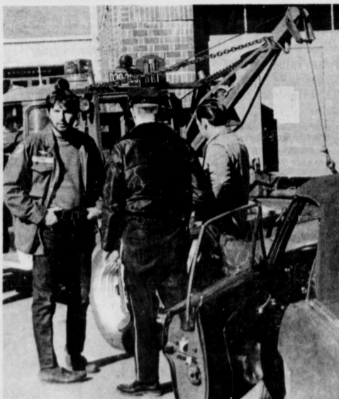
Unless you happen to have $7 in your pocket, this is what you go through to get your car lowered from a Crowe's Garage wrecker on campus. At left, a bewildered student is told Crowe's will tow the car away unless the truck driver

The latest student victim took his ticket and walked toward his car muttering "pretty sick, pretty sick." From all indications, he didn't think he was getting much of a break.