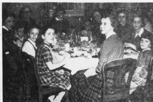
CHRISTMAS PARTIES—Some of the many underprivileged children and orphans that were entertained by sororities and fraternities the past two weeks are shown at a Christmas dinner. Later they received gifts of toys, clothes, fruit and candy from Santa Claus.