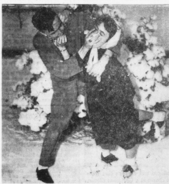
SNOWFIGHT! —Two UK students struggle to wash the other's face in snow in one of the snowfights that heralded the first big snow of the season this week.