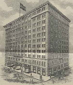
AT MAIN ENTRANCE TERMINAL STATION. F. A. HAMMOND.