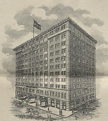
AT MAIN ENTRANCE TERMINAL STATION. F. A. HAMMOND.