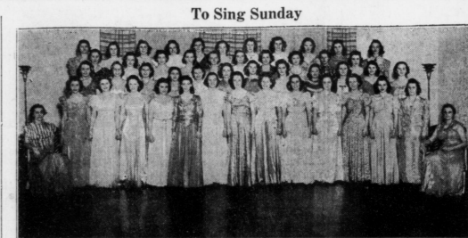
Women's Glee Club

With members of the Kentucky French clubs as guests, La Cerele Francaise of the University will hold a "Mi-Careme" (mid-19th) festival tomorrow on the campus. Headlining the festivities will be French play, "La Comedie de Ceuil qui Epousa une Femme Muette" (The Man Who Married a Dumb Wife), at 3 p. m. Saturday in Guignol theater.