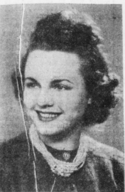
is general chairman for the Kappa Kappa Gamma dance.