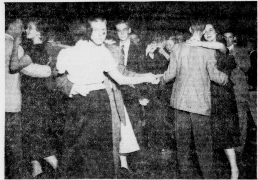
THE SGA DANCE last weekend proved to be a great success. Pictured here are a few of the couples, who, from all appearances, were having a great time. SGA has stated that if the last dance was a success, another would be held during the Tennessee week-end.

Lamp and Cross, Room 127, SUB, 8 p.m. ODK Tag Sale, Room 127, SUB, 7 p.m.