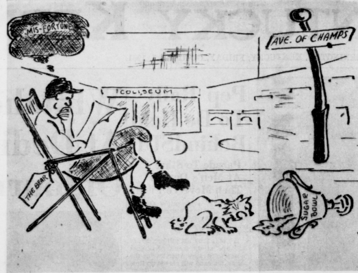
Hum—Nothing in here about Sugar rationing.

Tickets On Sale At Baldwin Piano Co. Louisville Phone WAsh 1565