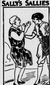
When she was asked to take a tramp to the park she said she never goes with such people.