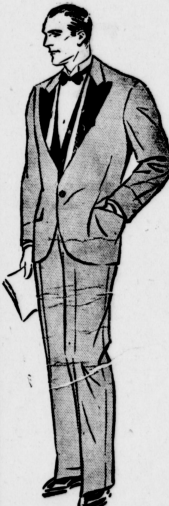
We Handle Tuxedo shirts and Collars