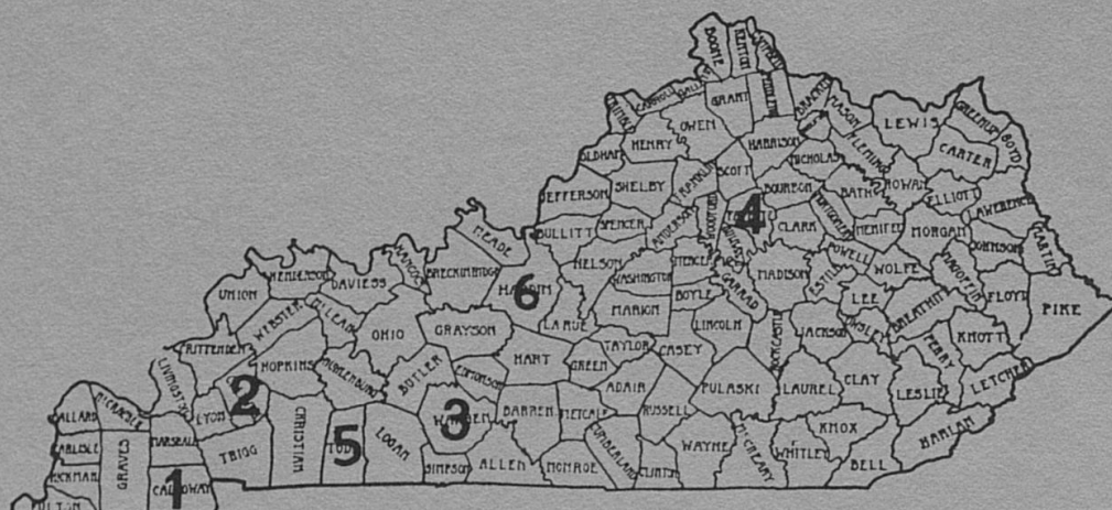
Fig. 1.—Testing locations of Kentucky small grain variety trials.