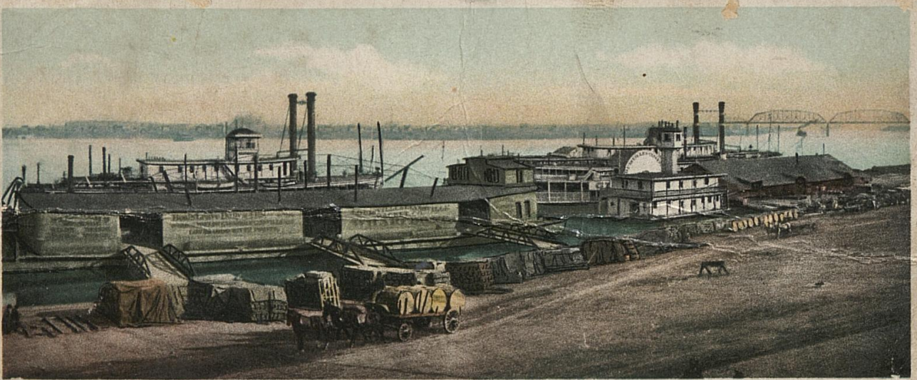
10433. THE LEVEE, LOUISVILLE, KY.

Mail to Miss - soon to your devoted Mother .