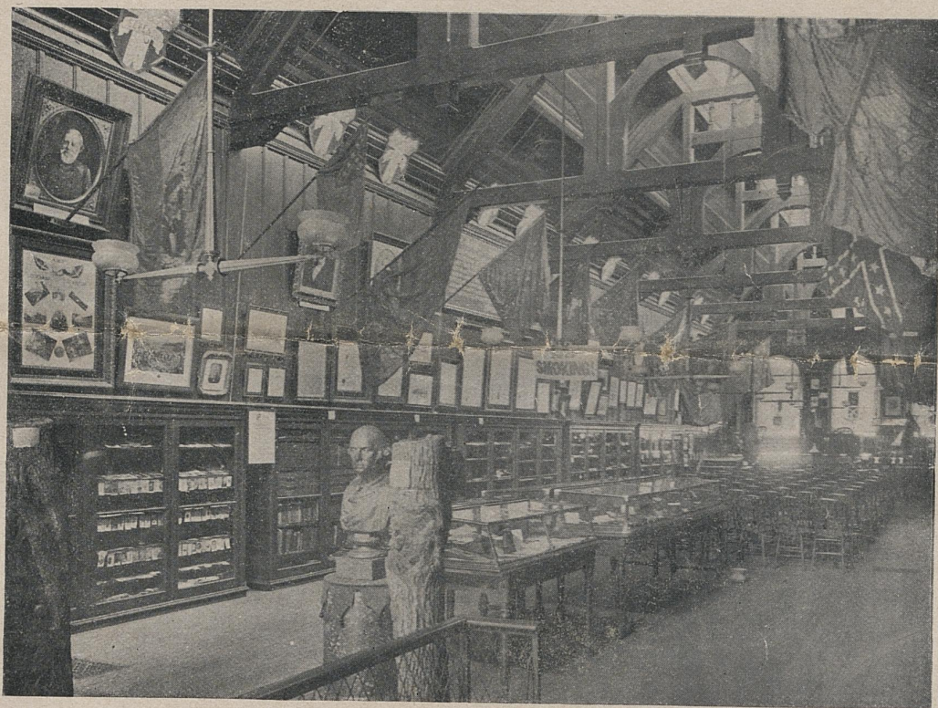
INTERIOR VIEW, MEMORIAL HALL.