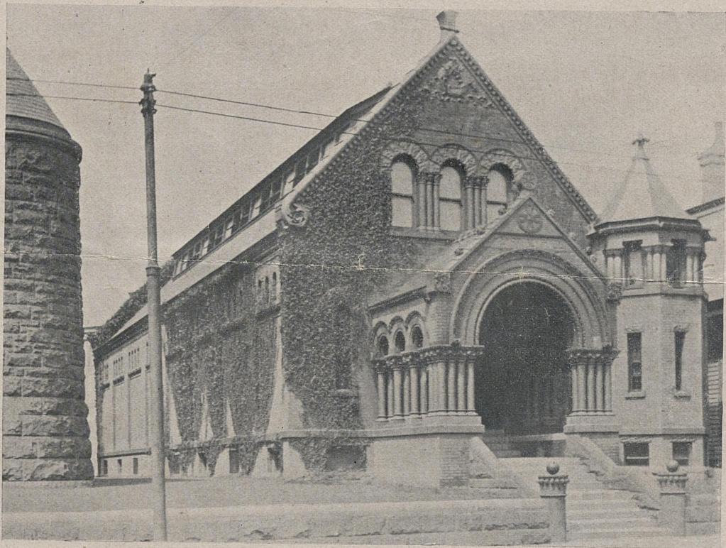
EXTERIOR VIEW OF MEMORIAL HALL.