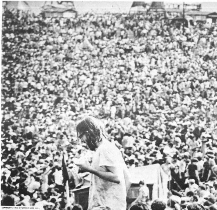
The Young Generation At Woodstock