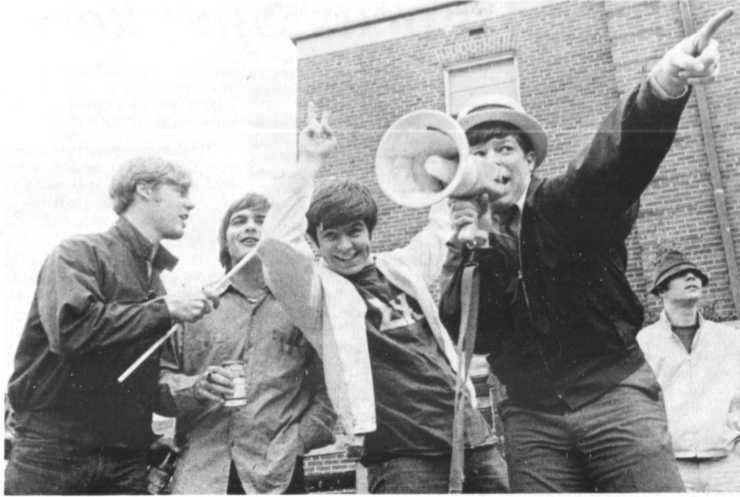
Kernel Photos By Dick Ware