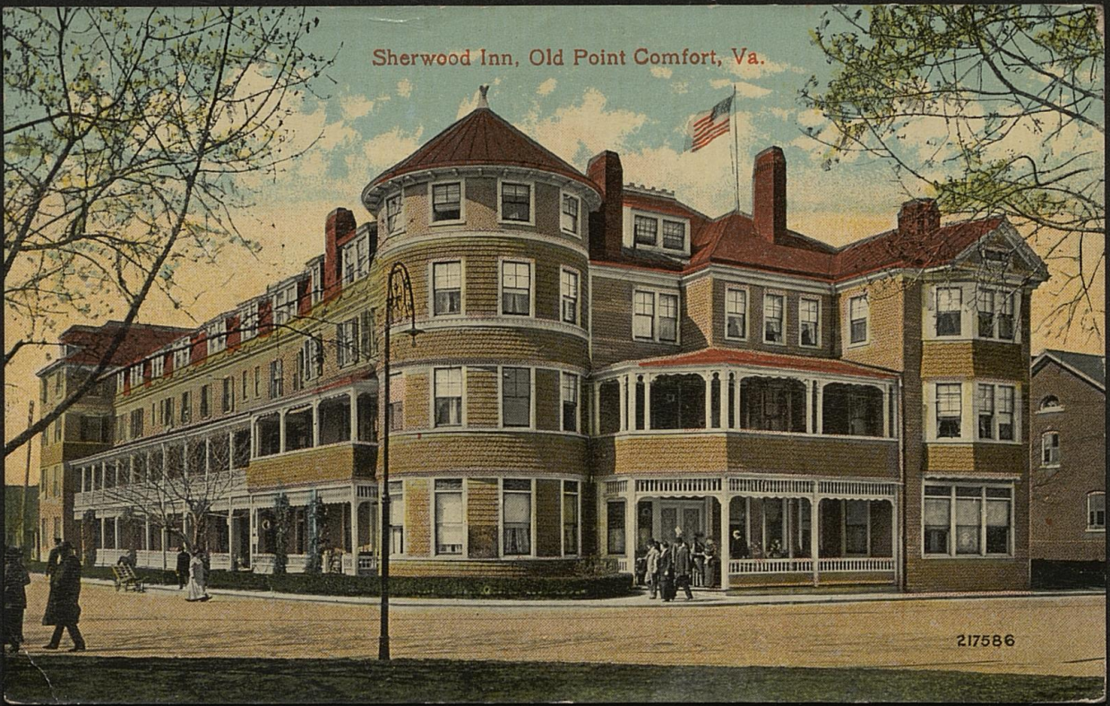
Sherwood Inn, Old Point Comfort, Va.