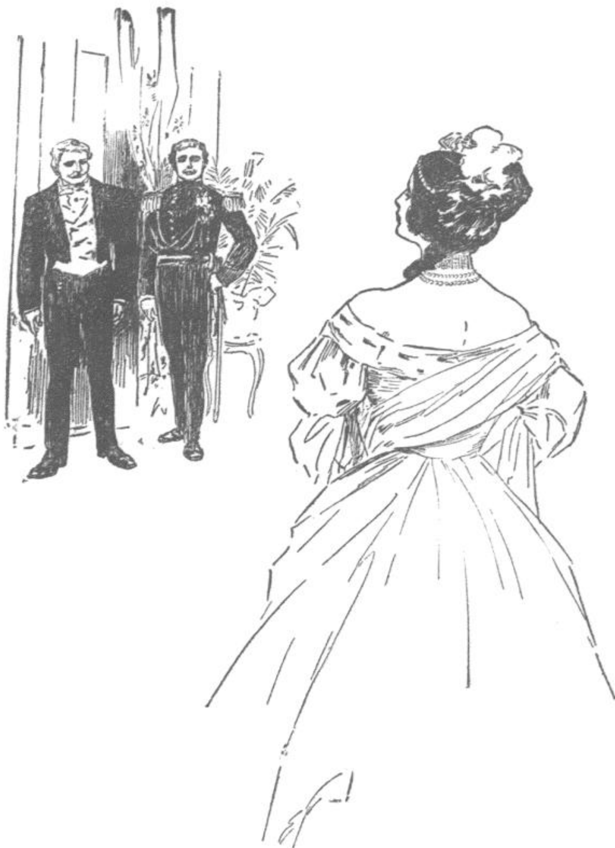
TWO FIGURES WERE APPROACHING