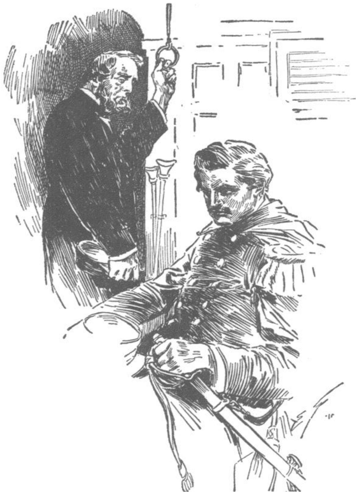
THE CAPTAIN PULLED A BELL ROPE