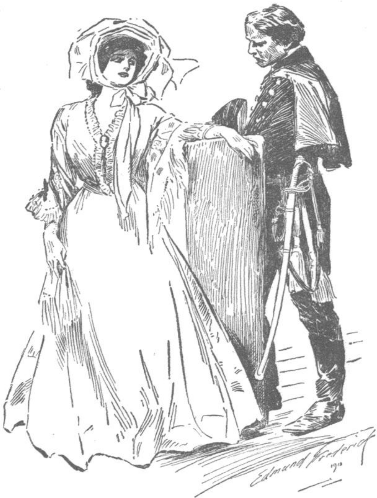
CARLISLE TURNED, A MAN'S ADMIRATION IN HIS EYES