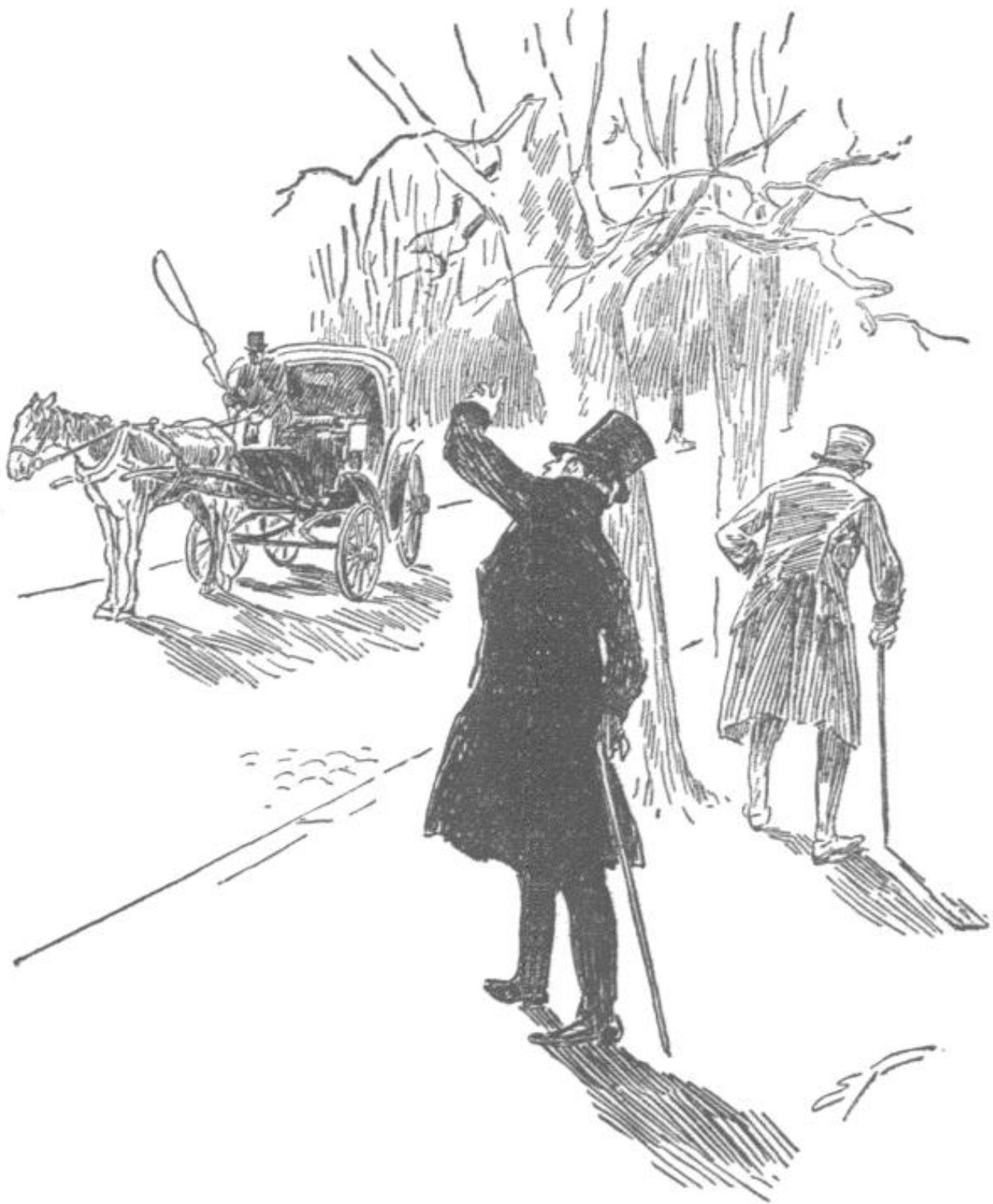
THEY PARTED, THE LAST SPEAKER HAILING A CARRIAGE