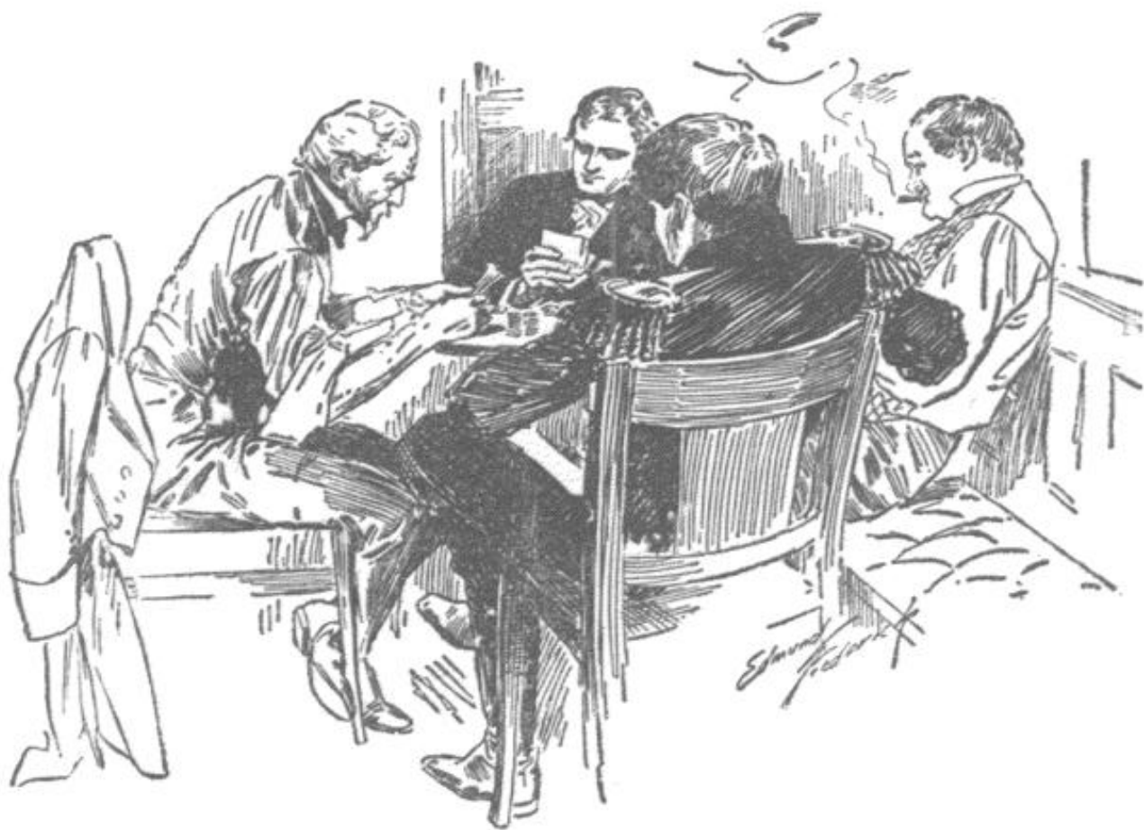
THEY MADE A GROUP NOT UNINTERESTING