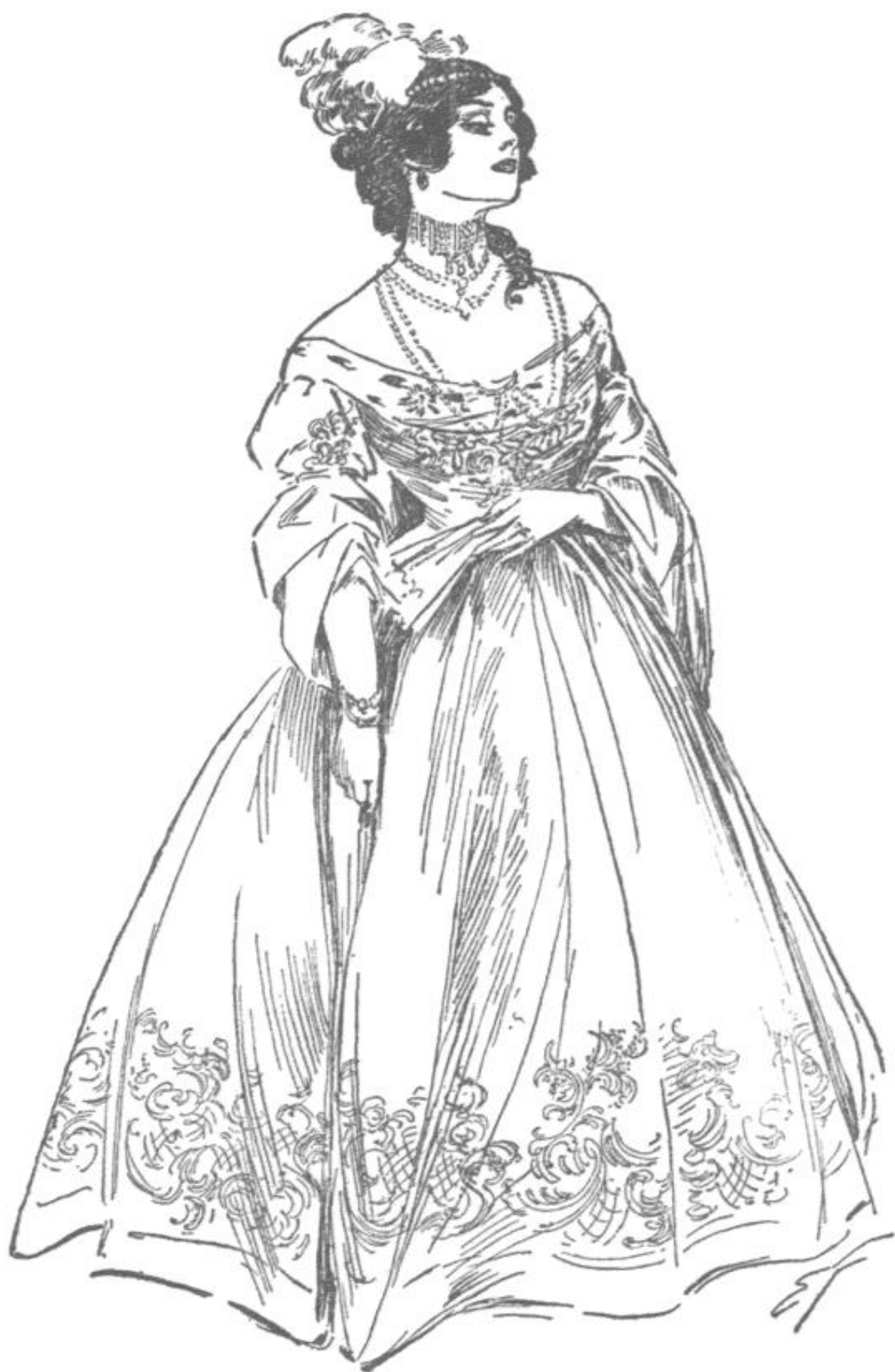
CLAD LIKE A QUEEN AND LOOKING ONE