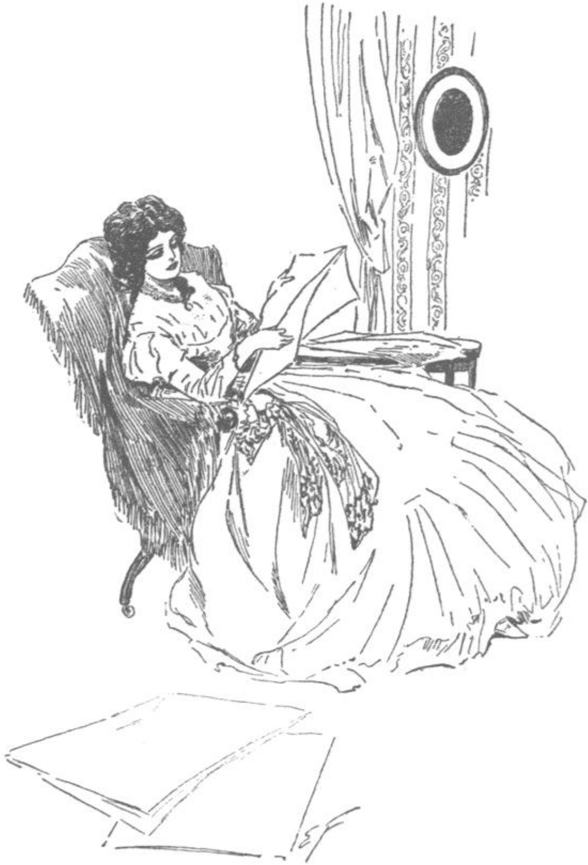
SHE LOOKED OVER THE JOURNALS OF THE DAY