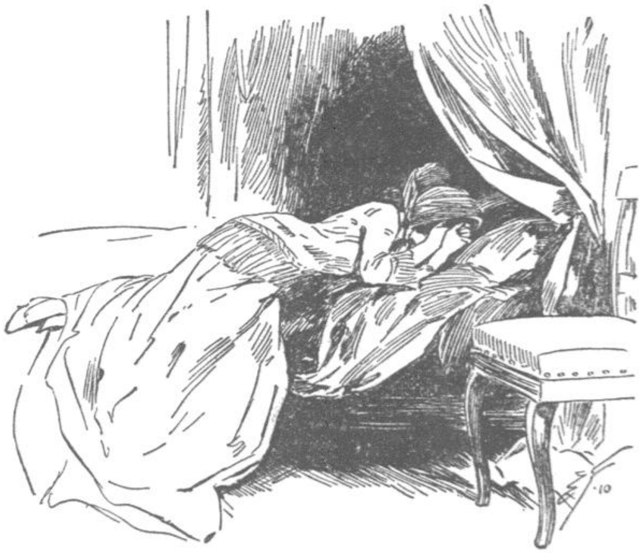
HER FINE COURAGE FOR ONCE OUTWORN