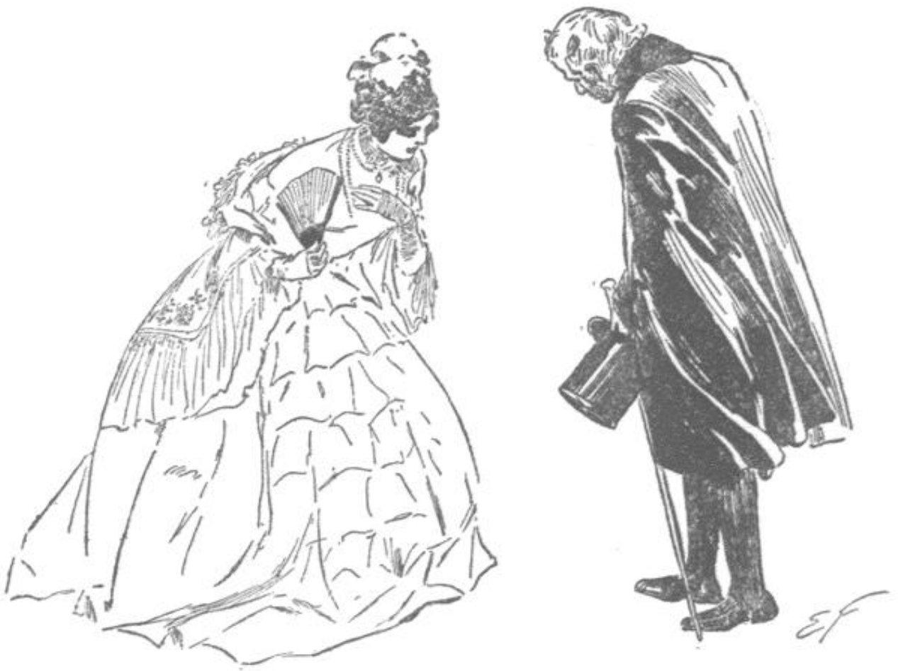
SHE DROPPED HIM A CURTSY