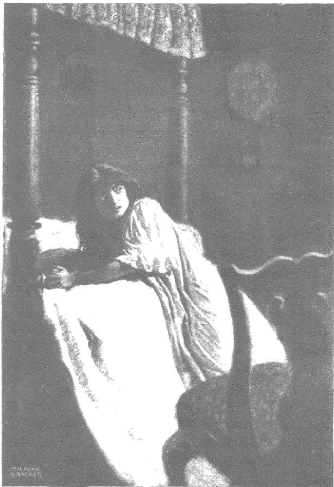
SHE FLUNG HERSELF UPON THE BED.— Page 153.