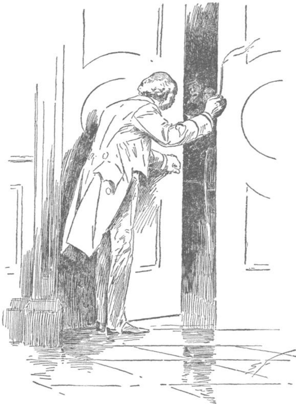
A COLORED MAN APPEARED WITH LIGHTED TAPER