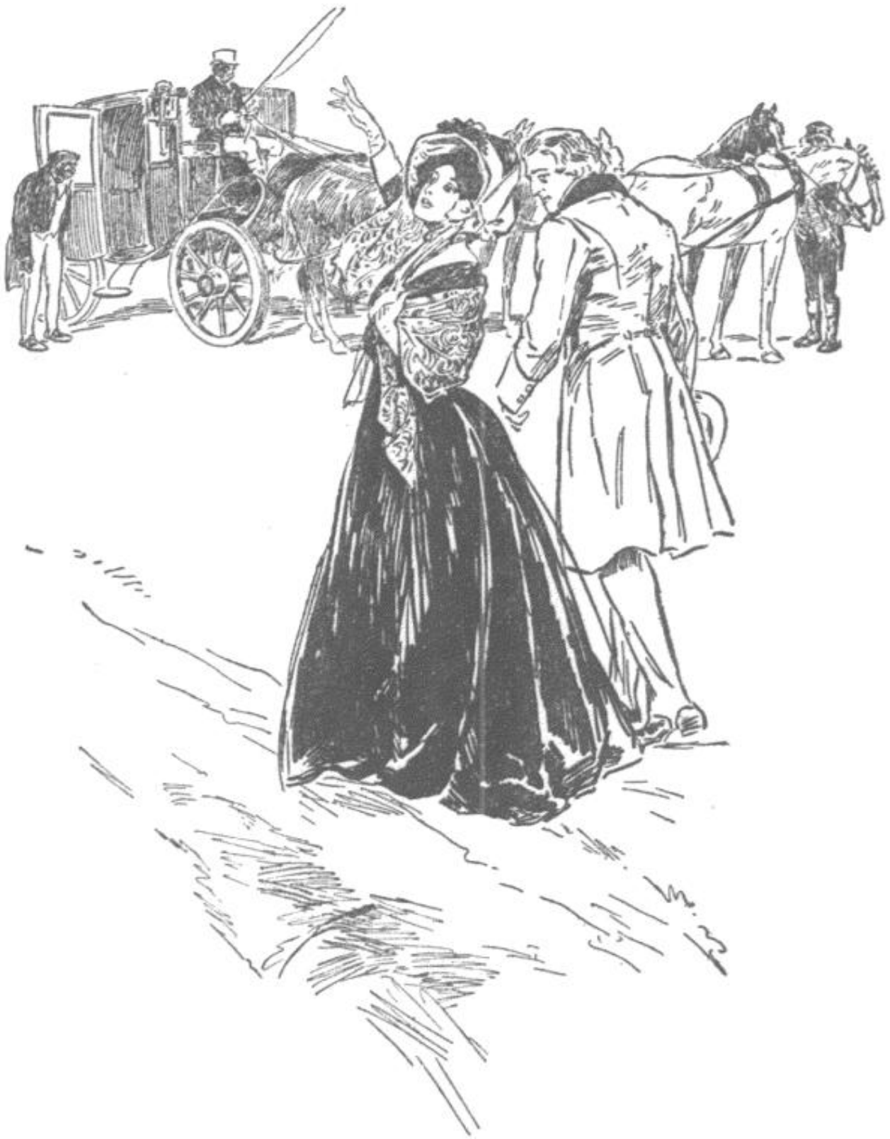
SHE WAVED A HAND IN FAREWELL