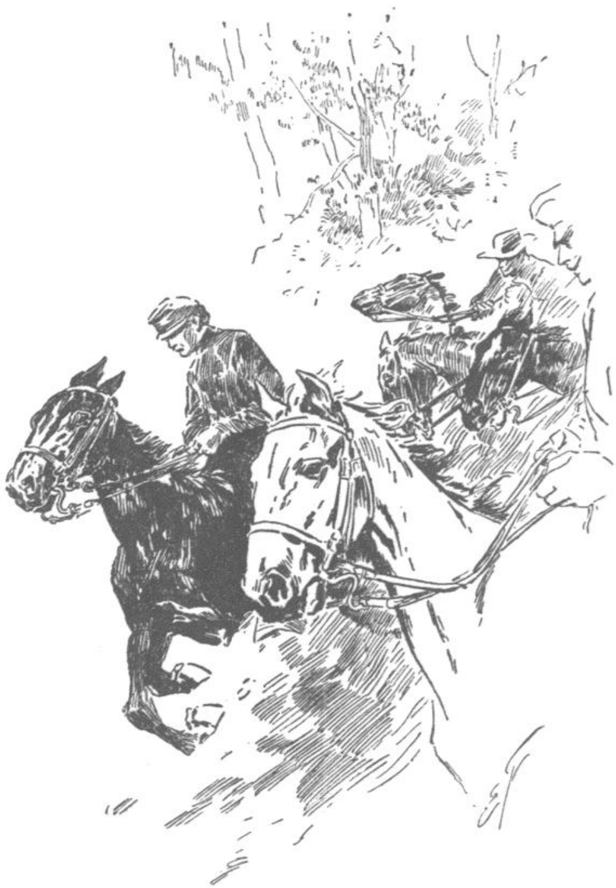
CLATTERING HOOFS RESOUNDED ALONG THE ROAD