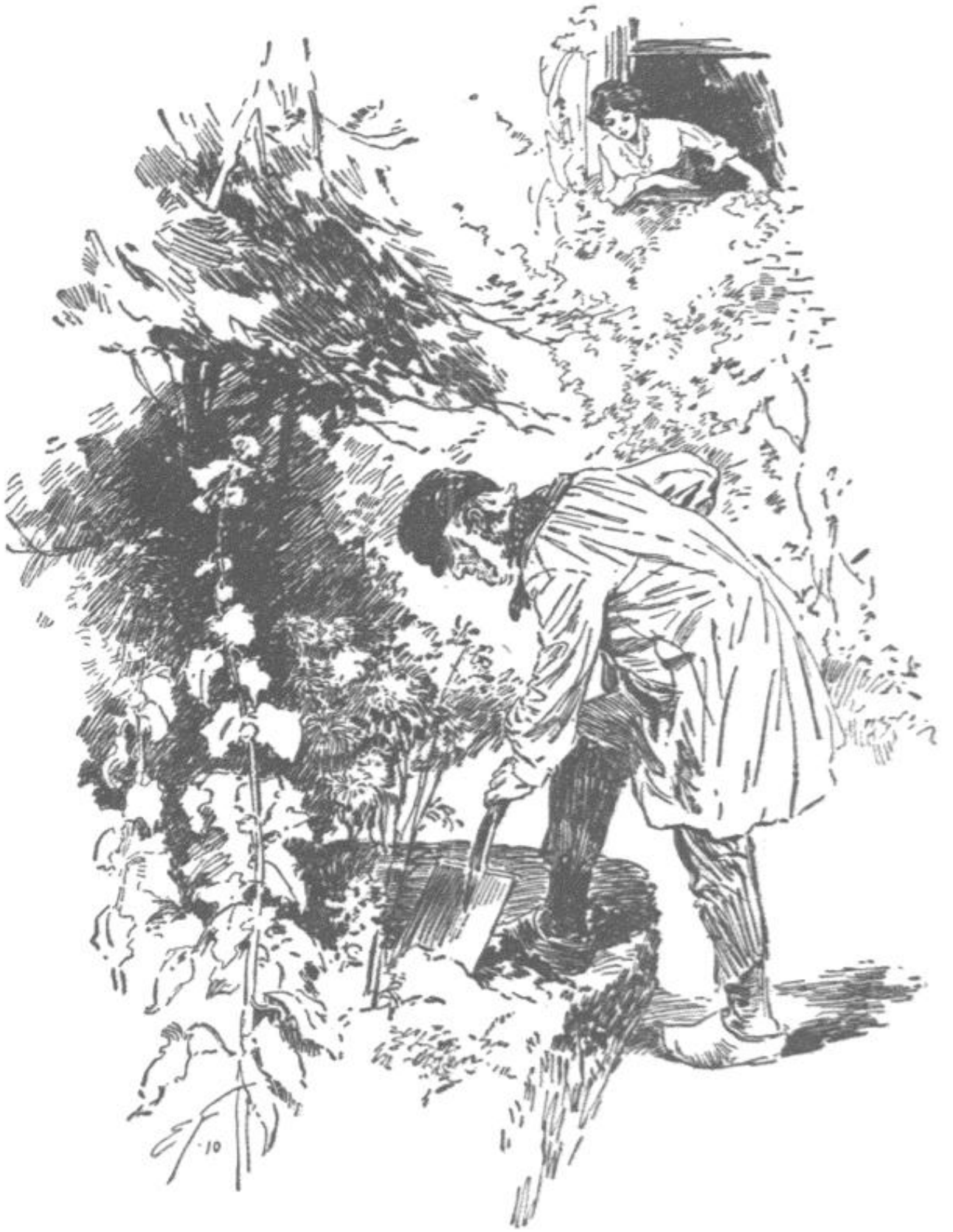
AN OLD MAN, BROWN, BENT AND WRINKLED