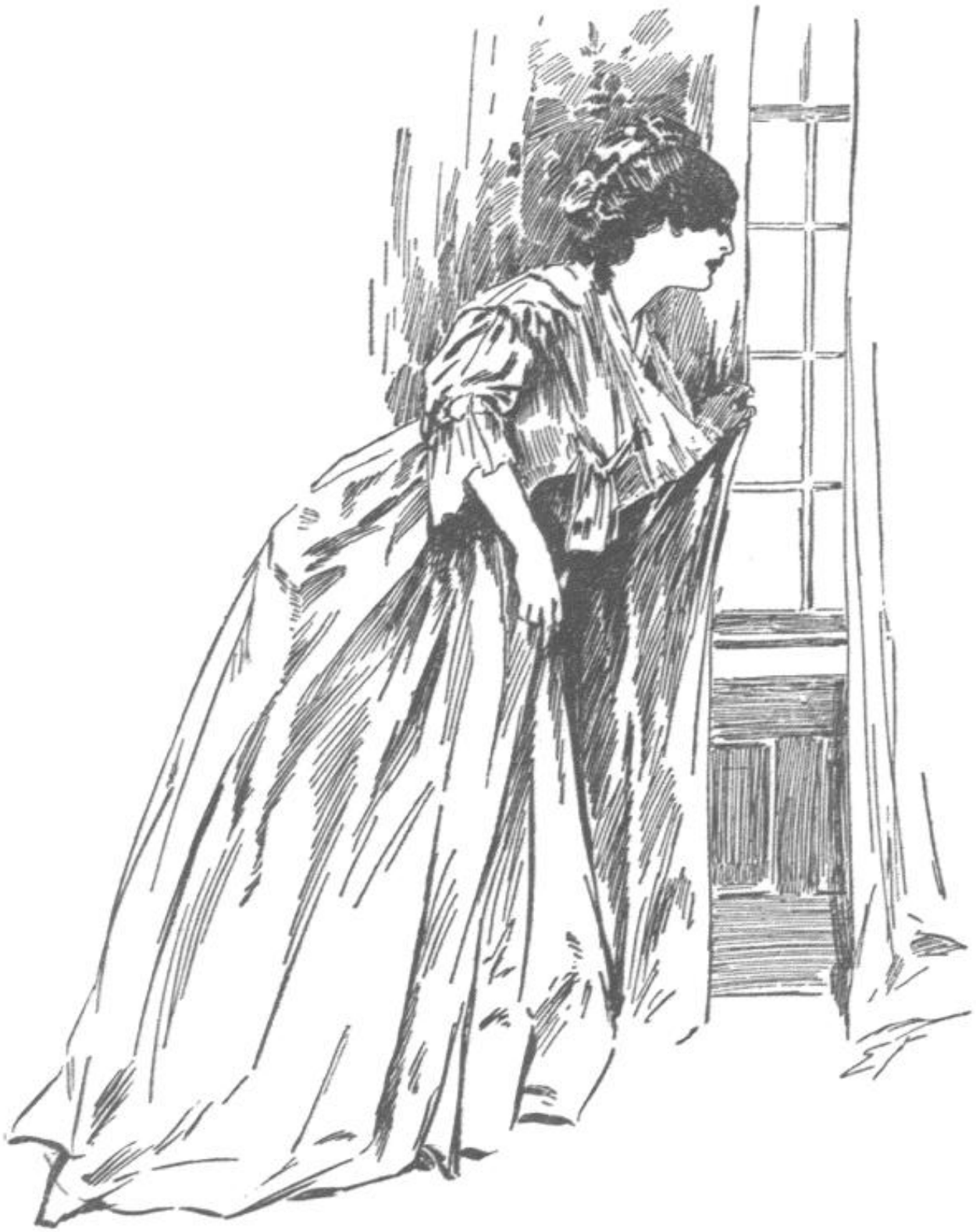
AN EXCLAMATION FROM JEANNE CAUSED HER TO HASTEN