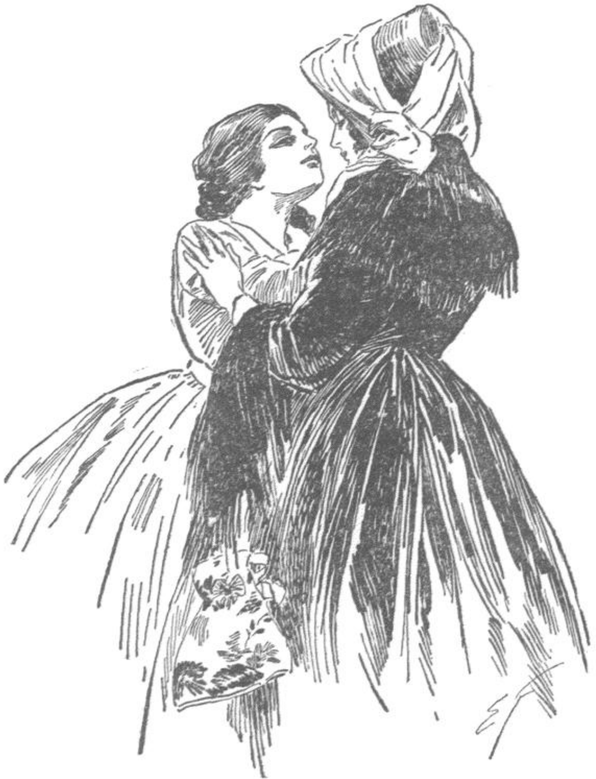
WOMAN FASHION, THESE TWO NOW MET