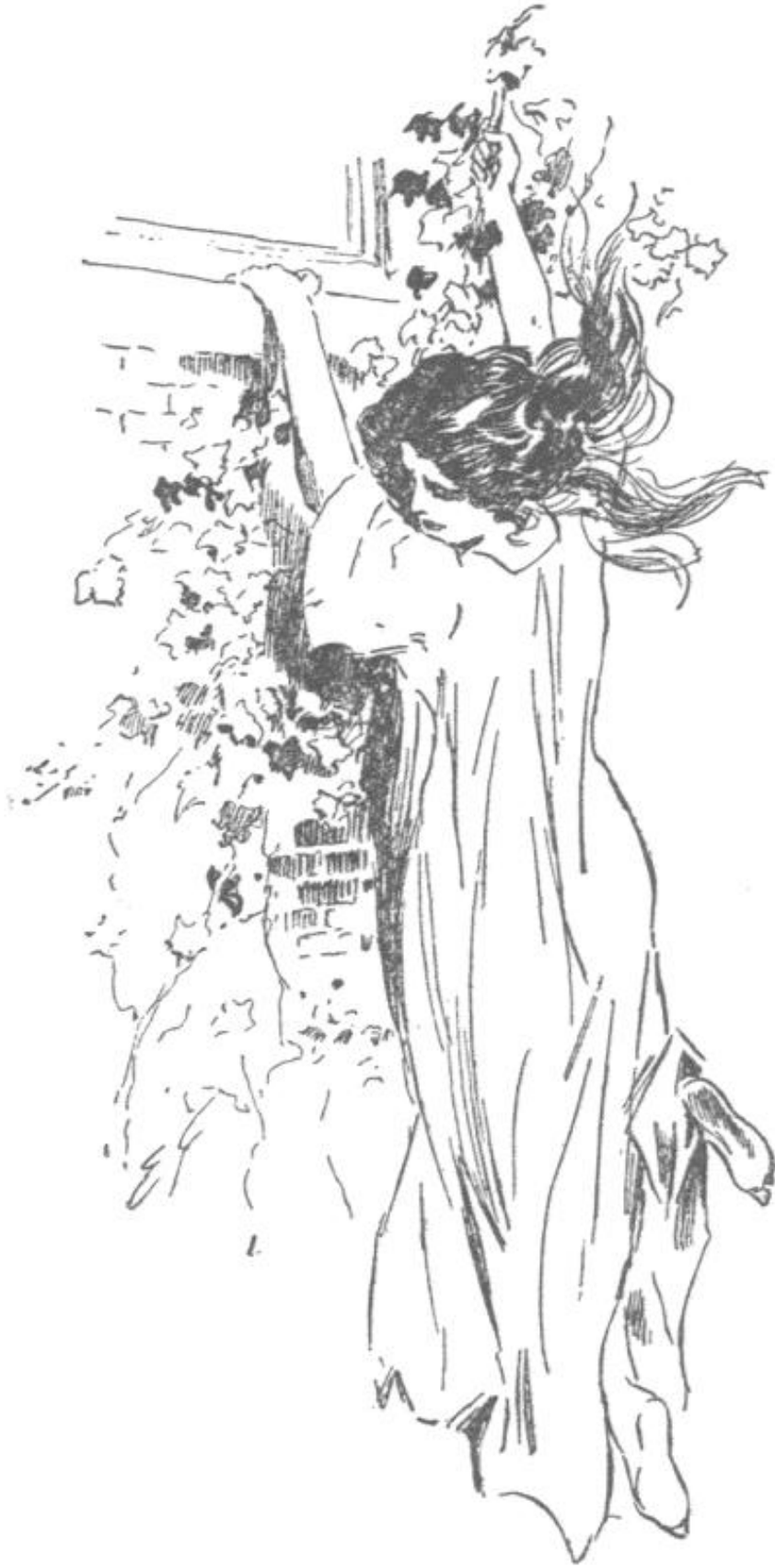
SHE GRASPED WILDLY AT THE SCREEN OF IVY