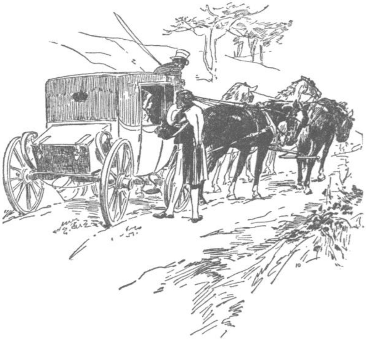
HE APPROACHED THE WINDOW, HAT IN HAND