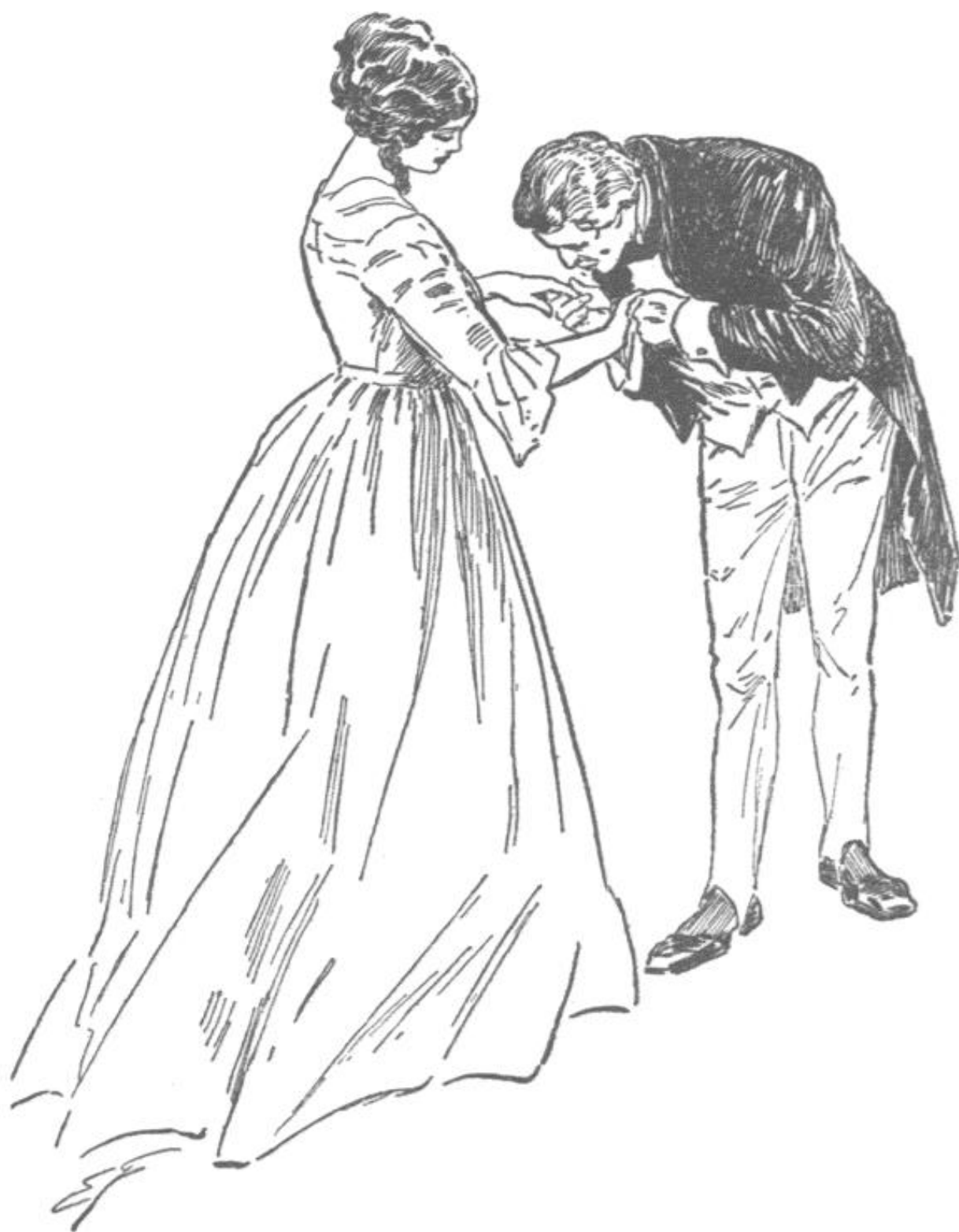
HE BENT AND KISSED HER HANDS