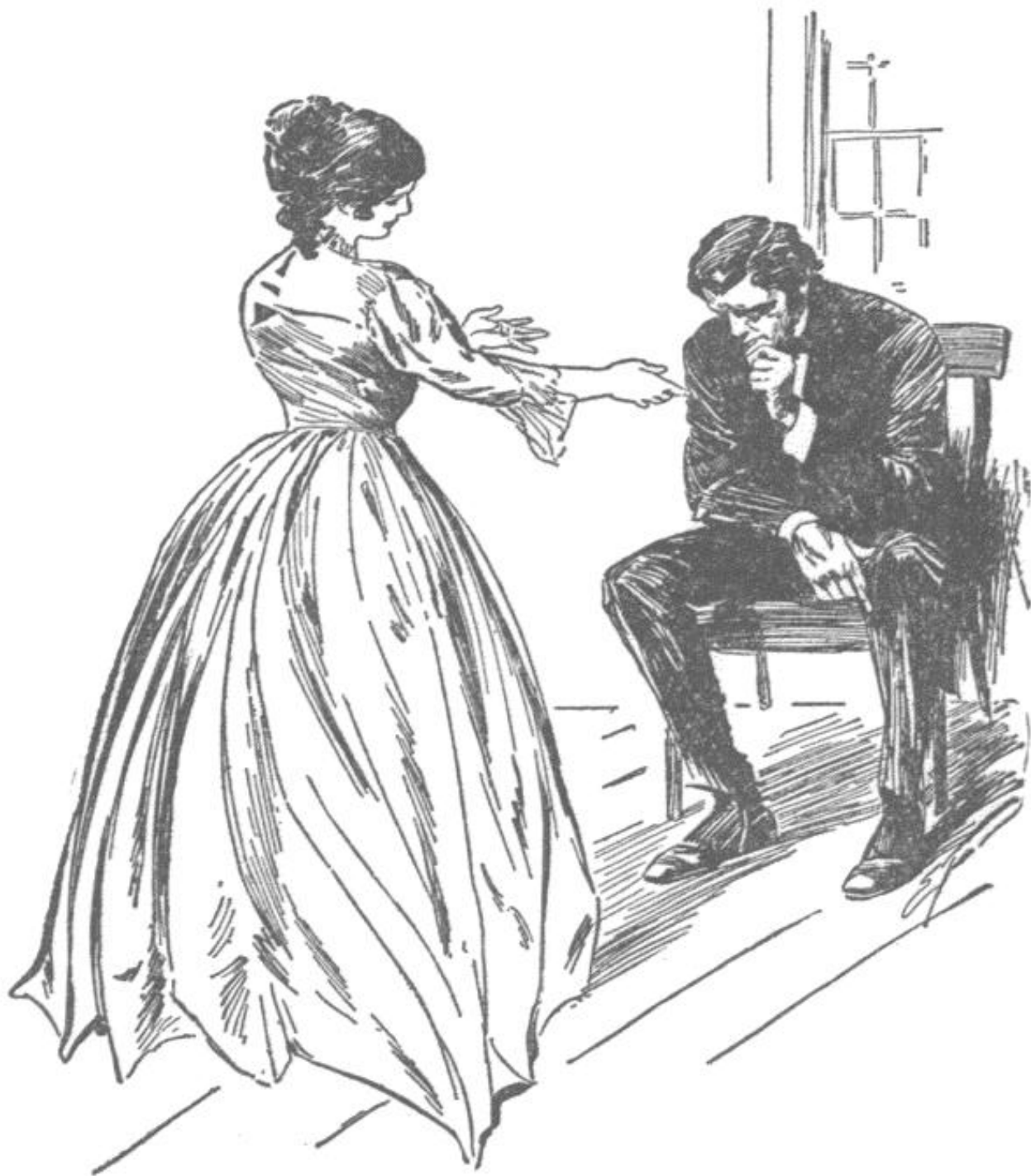
SHE TURNED, SPREADING OUT HER HANDS