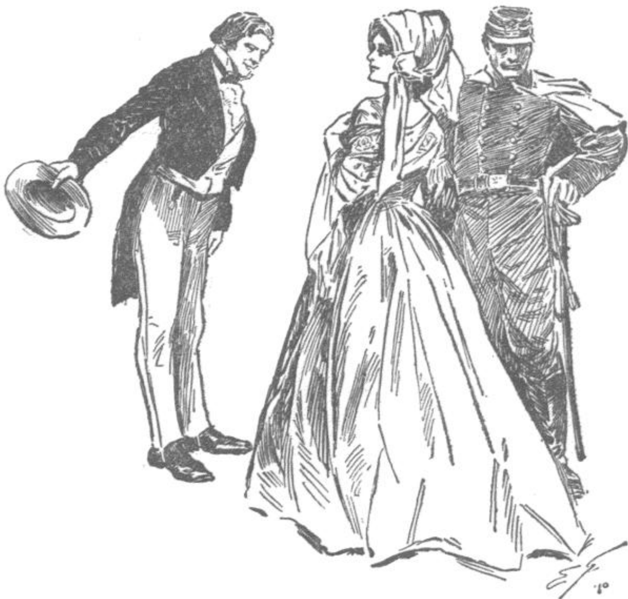
HE STILL BOWED, WITH RESPECTFUL GLANCES