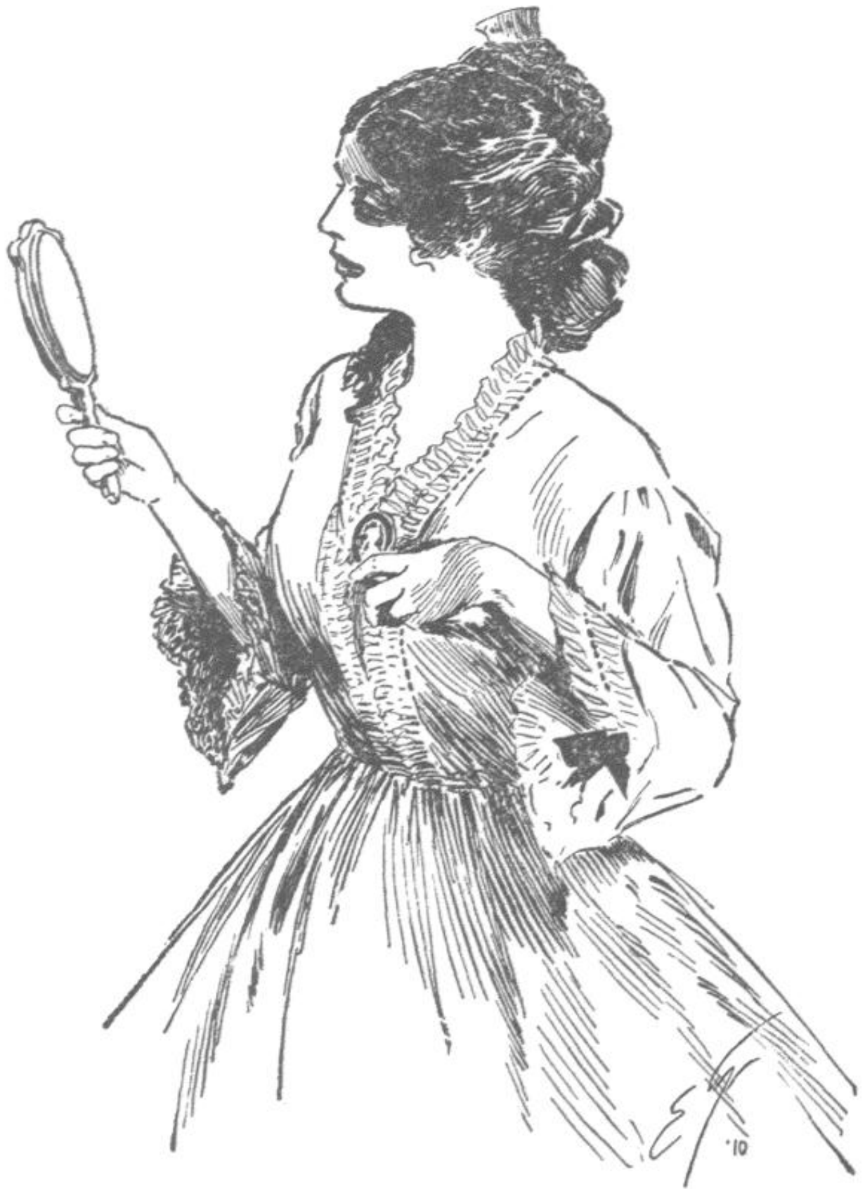
THE TRACES OF TRAVEL HAD BEEN REMOVED