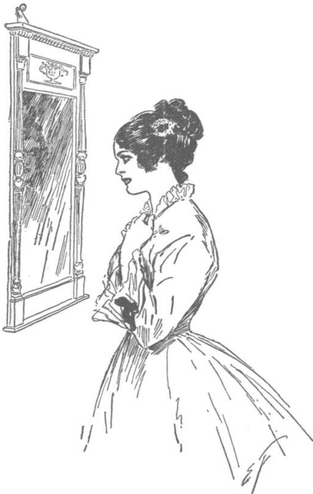
GAZING STEADFASTLY INTO THE GLASS