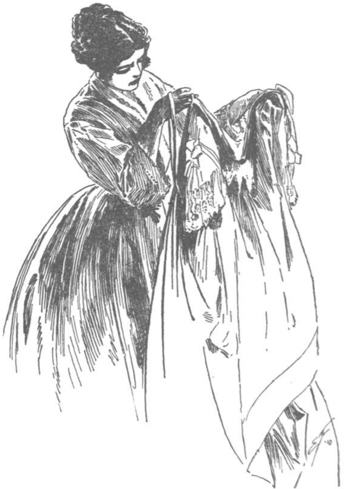
THEY WERE GARMENTS OF A DAY GONE BY