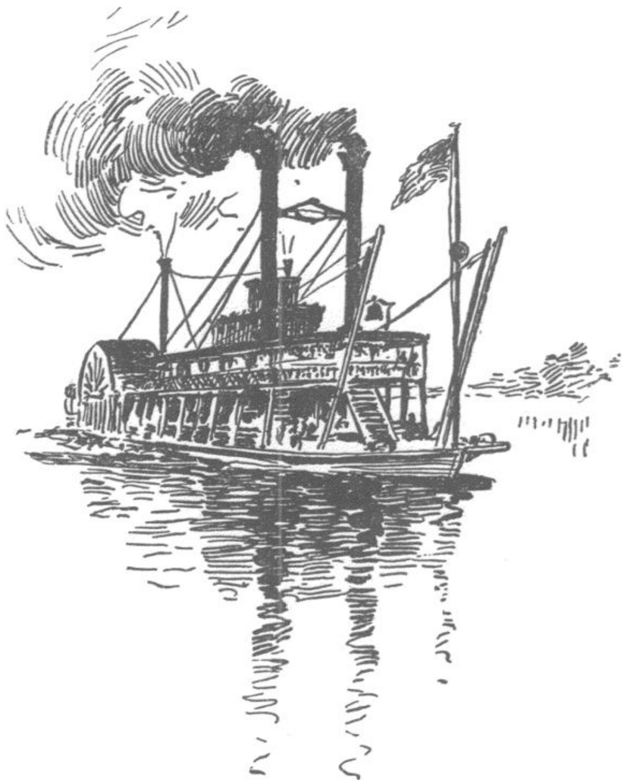
THE MOUNT VERNON