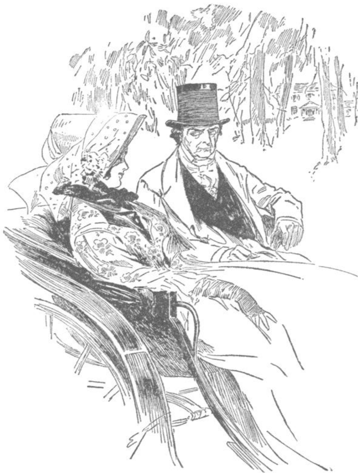
THEY ENTERED WIDE GROUNDS