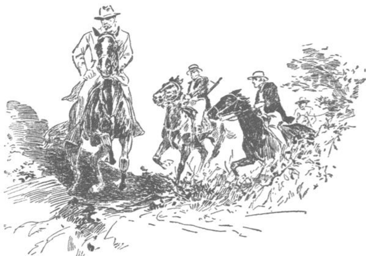
A PARTY OF FOUR HORSEMEN APPEARED