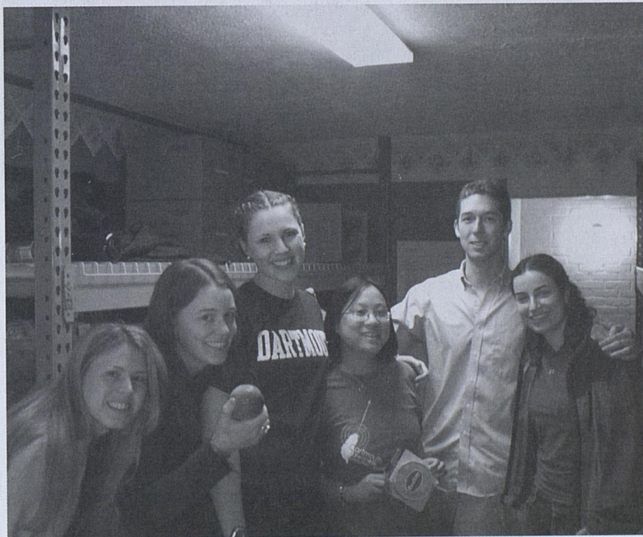
Dartmouth Medical School Students

March 11th - 17th, seven medical and public health students from Dartmouth Medical School arrived at Wenderover for their first Spring Service Trip. During their stay, the students shadowed healthcare professionals at the clinics and observed a variety of surgeries at the Mary Breckinridge Hospital. The students also volunteered to work on projects in Hyden including the distribution of food for the Leslie County Food Pantry and with Save the Children after school reading program at the Hyden Elementary School.