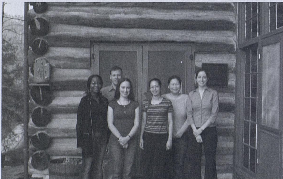
University of Maryland Students

March 17th - 23rd, five medical school students and one nursing student from the University of Maryland arrived at Wendover for their annual spring trip called Medical Breakaway. While in Leslie County, the students taught sessions on nutrition and the effects of smoking at Big Creek Elementary School and shadowed healthcare professionals in the clinics and hospital. The students also volunteered to paint fences at Wendover.