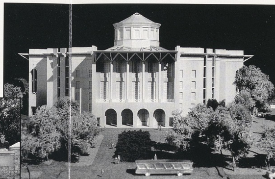
Model of new William T. Young Library