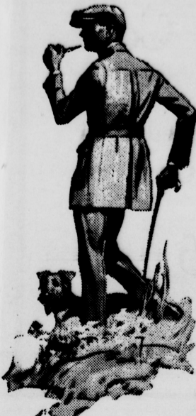
Copyright 1922 Hart Schaffner & Marx

HIGH-CLASS "VODVIL" OF 7 BIG ACTS BEN ALI THEATRE "THE BIGGEST SHOW ON EARTH FOR THE MONEY."