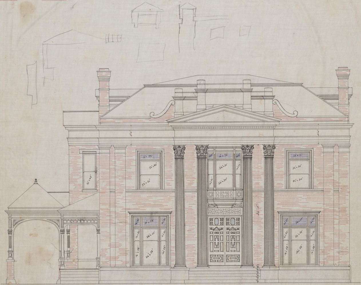
— FRONT ELEVATION —

S. E. DES JARDINS, ARCHT 1/4 IN SCALE CINCINNATI.