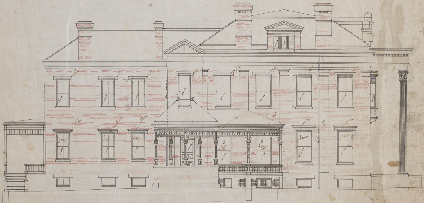
— WEST ELEVATION —

SE DES JARDINS, ARCHT 1/4 IN. SCALE CINCINNATI.