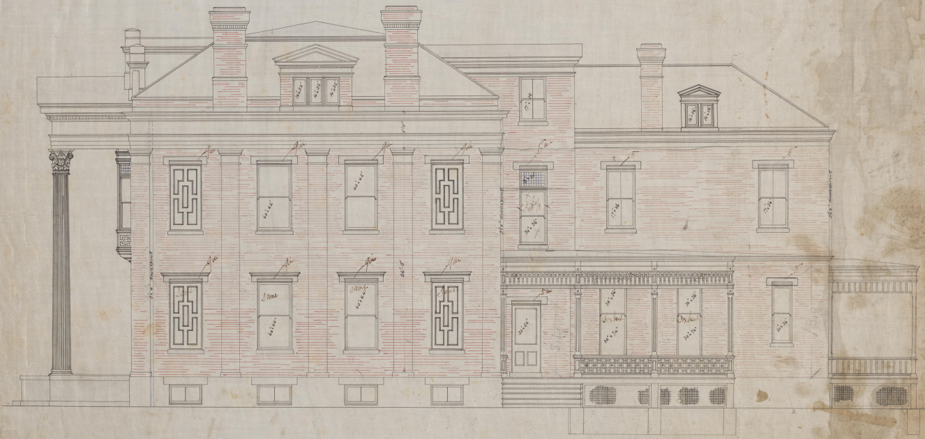
— EAST ELEVATION —