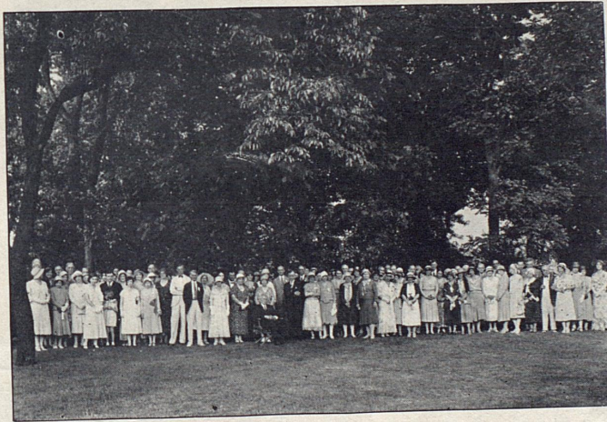
The 1931 Alumni Reunion Groups at Maxwell Place