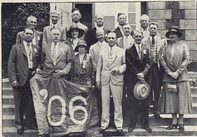
MEMBERS OF THE CLASS OF '06 WHO ATTENDED THE REUNION (See Page Six of this Issue)