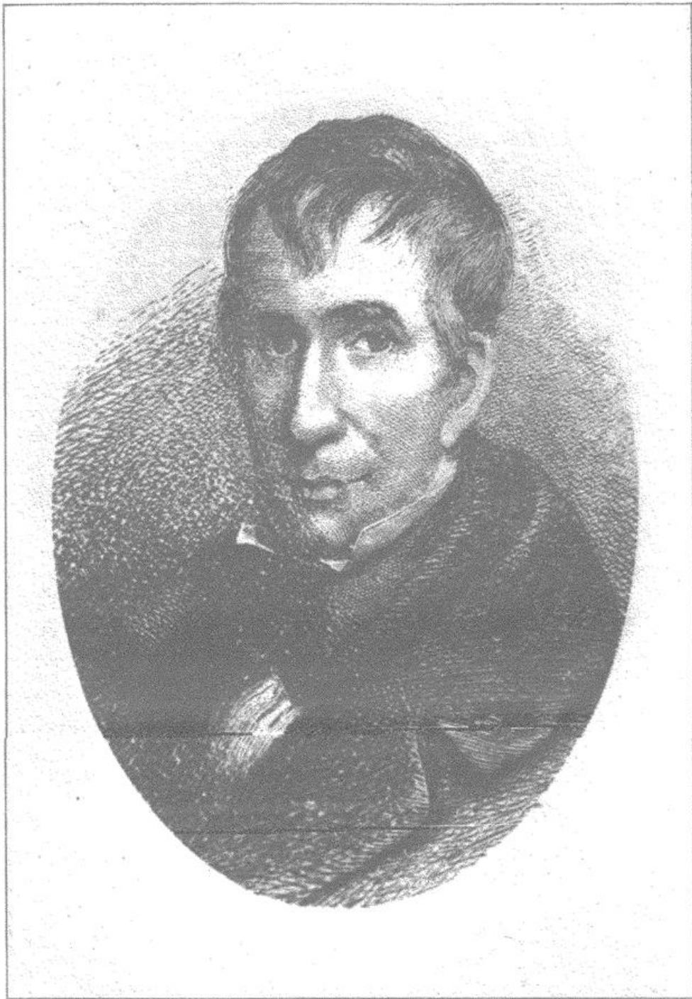
GENERAL WILLIAM HENRY HARRISON.