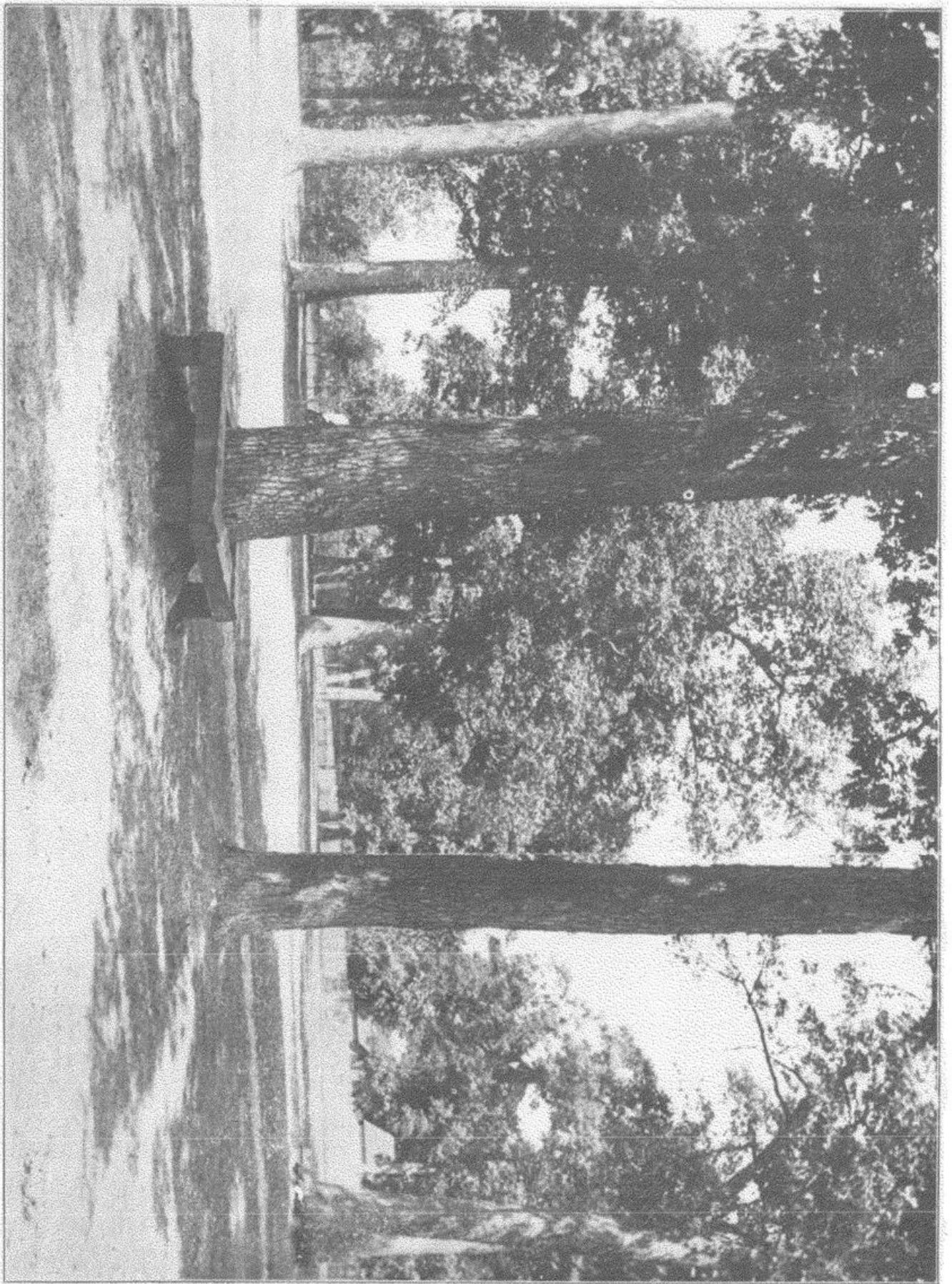
TIPPECANOE BATTLE-GROUND—ANGLE AT POINT OF FIRST ATTACK.

Taken on the ground by Captain Alfred Pirle.