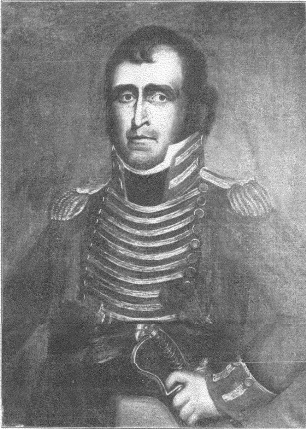
COLONEL JOSEPH HAMILTON DAVIESS.