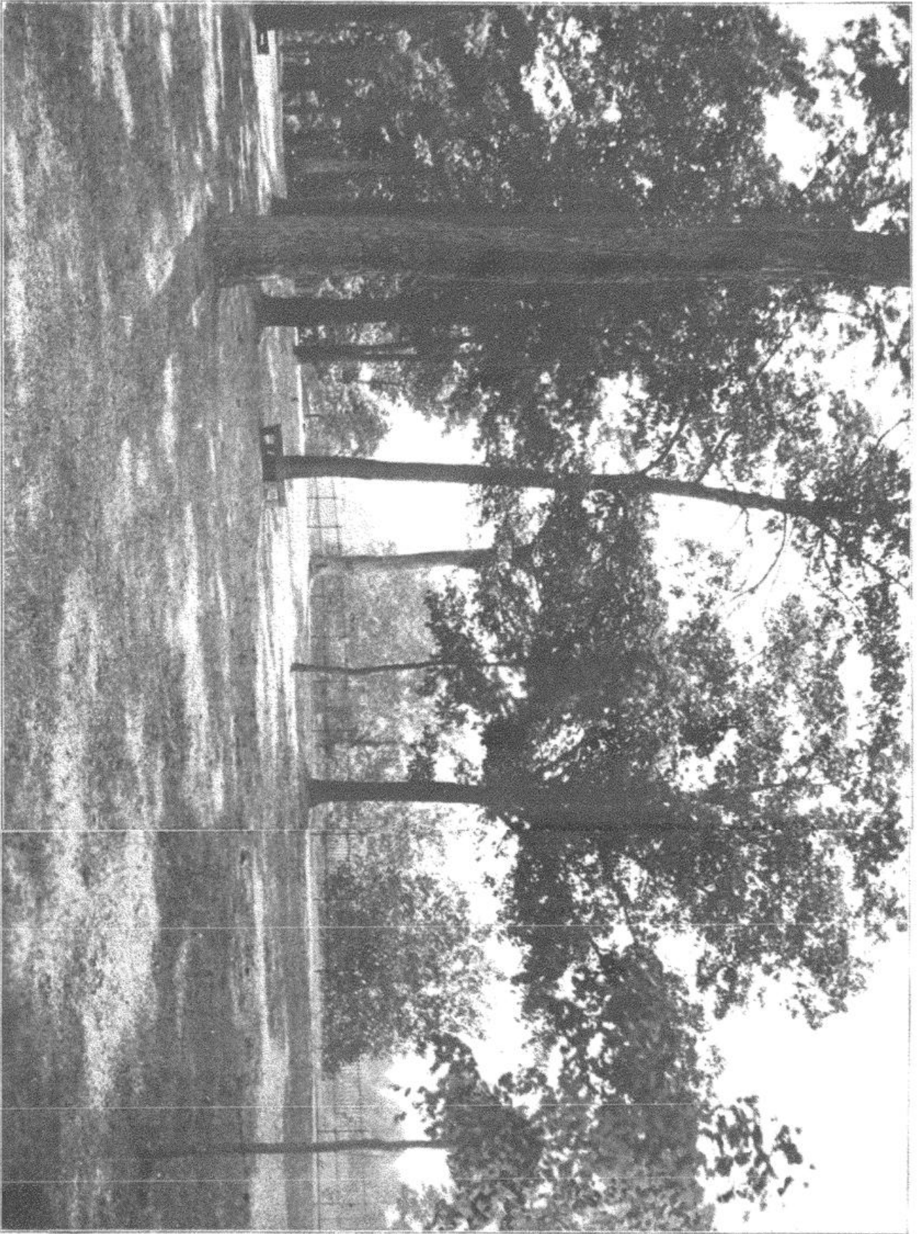
TIPPECANOE BATTLE-GROUND—VIEW OF CENTER OF REAR LINE.

Taken on the ground by Captain Alfred Pirrie.