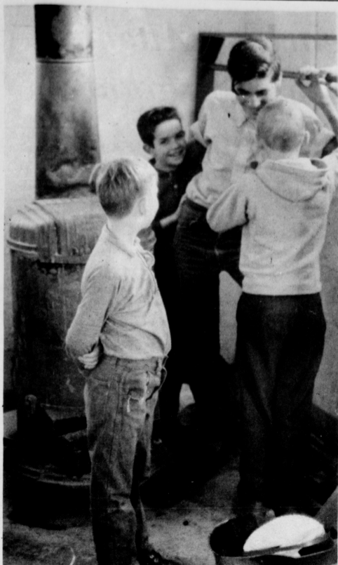
This is one theater of the War on Poverty that UK students may witness in two YM-YWCA traveling seminars March 13-26.

Both projects will be financed largely by funds allowed by the budget, but all participants will pay a minimum of $20 for transportation and other expenses.