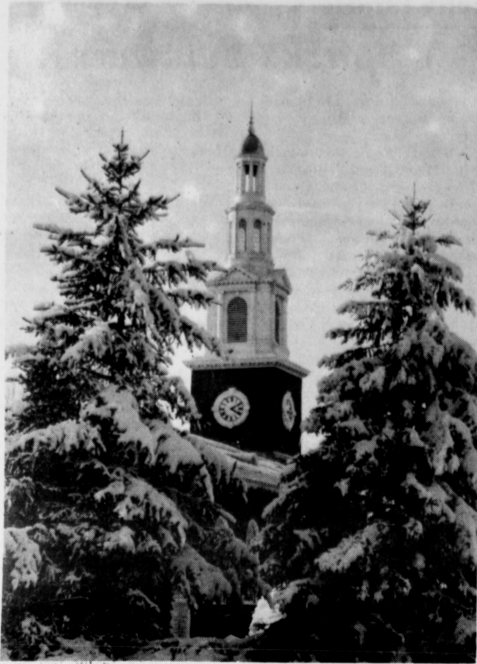
Kernel