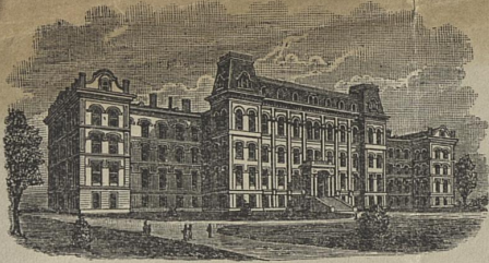
MASONIC WIDOWS AND ORPHANS' HOME.