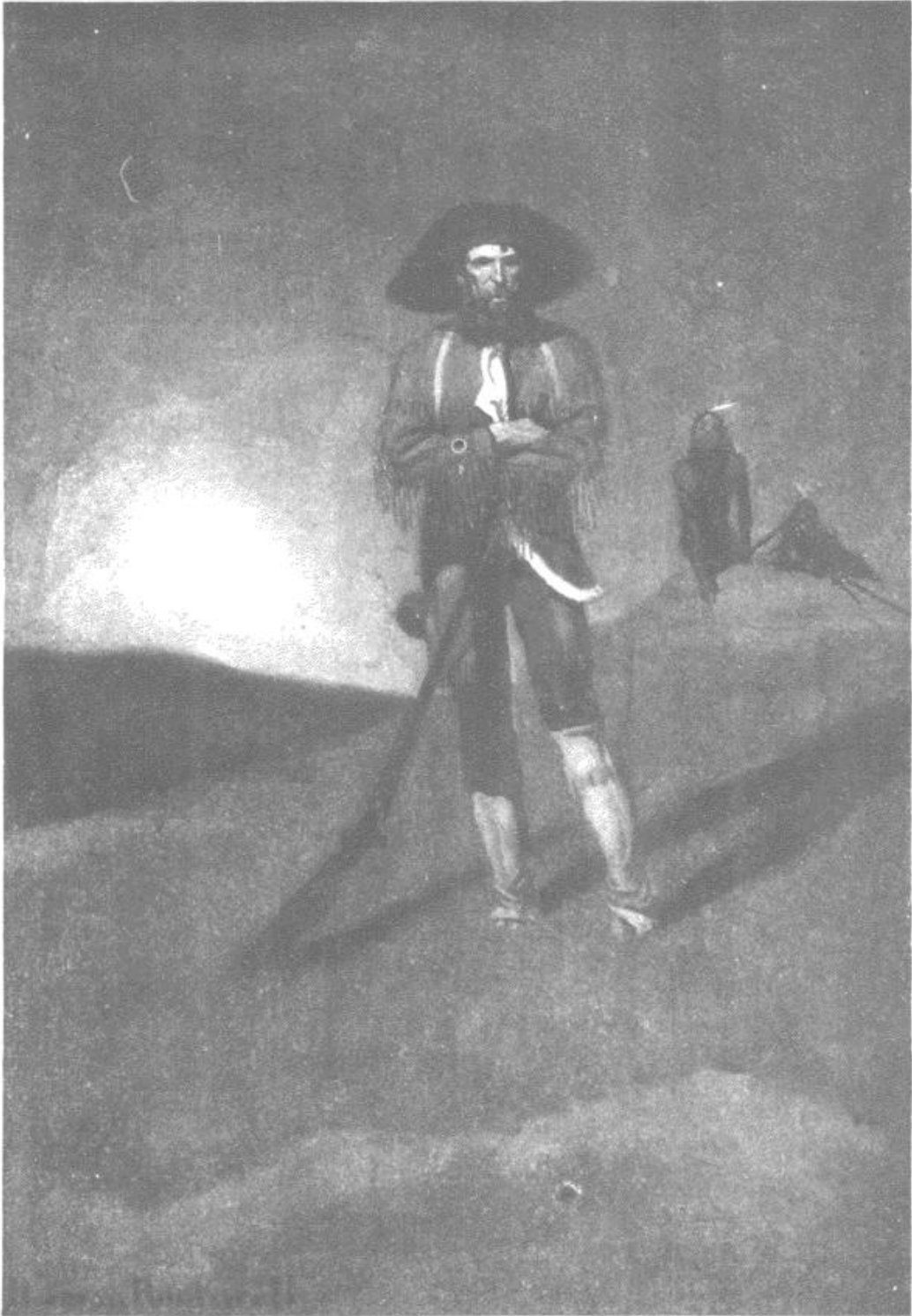
“One of the men who had been stationed as a guard was shot early in the morning”