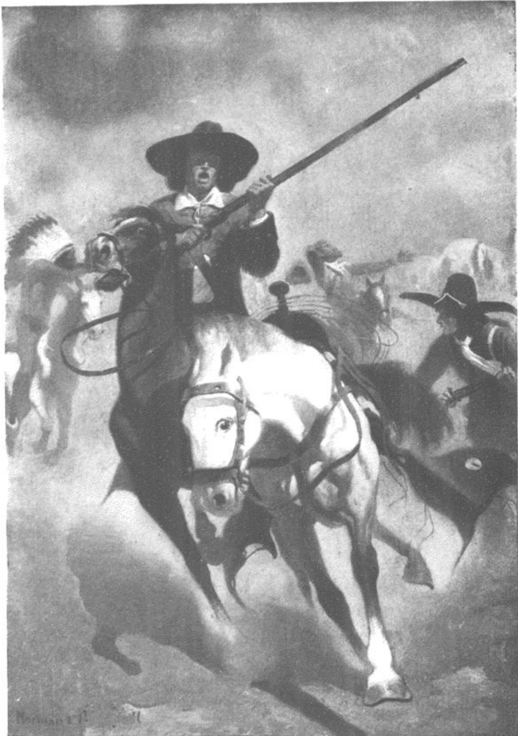
“On the August air arose the reports of many rifles and the terrifying whoops of the Indians”