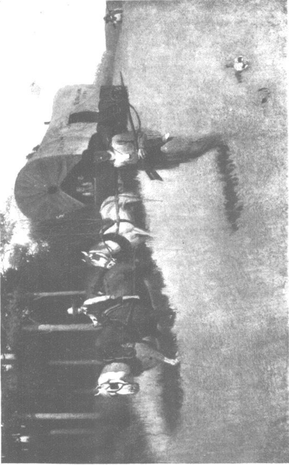
“The scout, with his family, returned to Boonesborough”