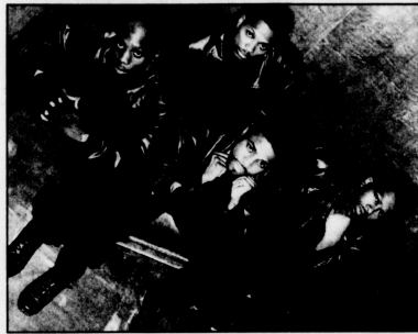
DEAD END Blackstreet's sophomore effort fails to tread any new waters in regards to musical styles.