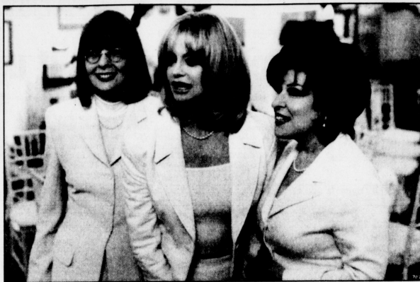
THREE'S A CROWD Diane Keaton (left), Goldie Hawn and Bette Midler celebrate their divorce status in The First Wives Club . Bruce Willis (below left) stars as gun-for-hire John Smith in Last Man Standing .

The First Wives Club tells the story of three wealthy women, Midler, Keaton, and Hawn, who have just been dumped by their husbands for younger, prettier girls, Berkley, Parker and Harden. The women team up to make The First Wives Club , and a delightful trio. Hawn, a ruined movie star, Midler, an outspoken housewife, and Keaton, a shy housewife, have two things in common: they've all