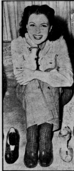
Dancer Eleanor Powell wears out 50 pairs of shoes a year on the stage, but offstage she's rationed to three pairs just like the rest of us. She chooses black suede for daytime, moccasins for sports, lucite sandals for formal.