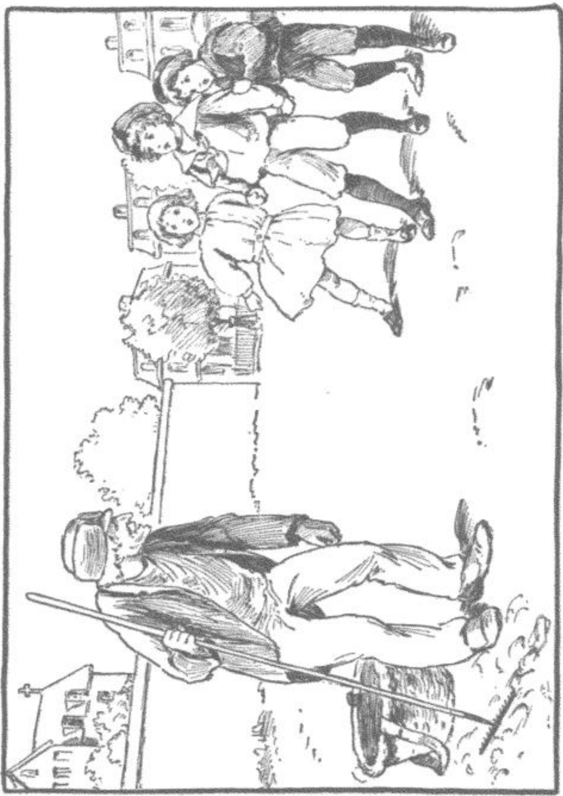
"HE TURNED AROUND SUDDENLY."