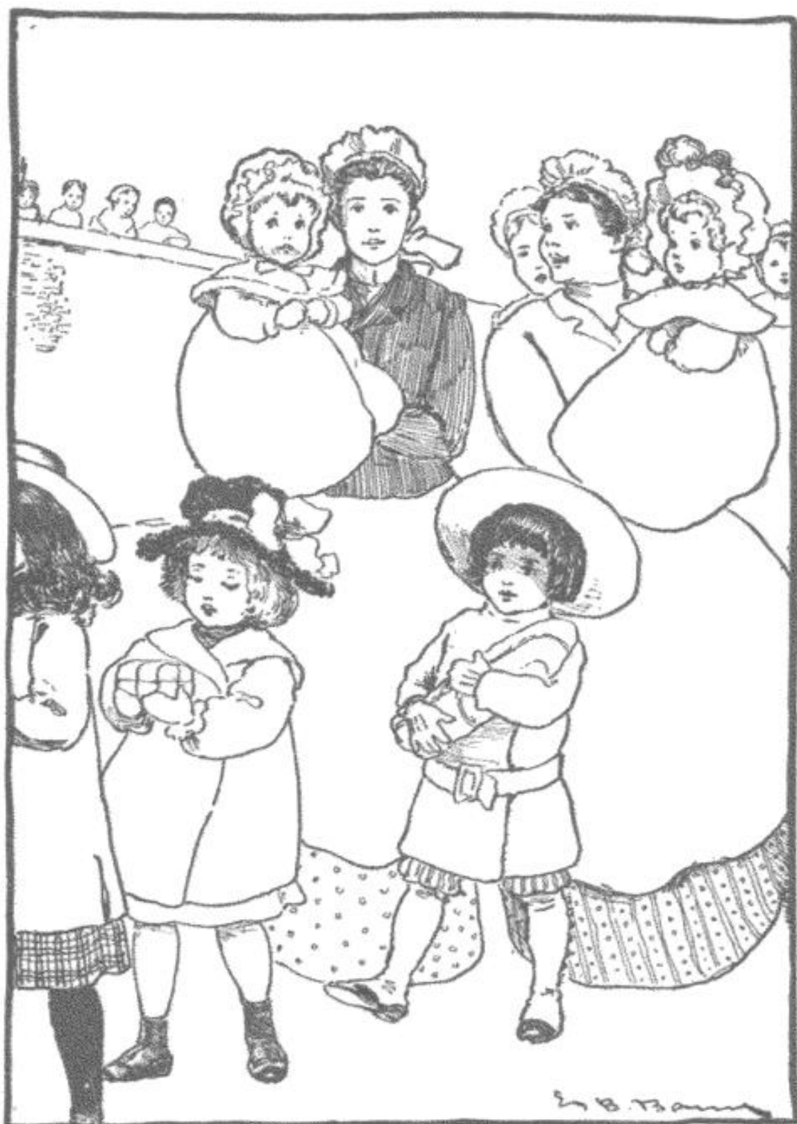
"AFTER THEM FOLLOWED THE NURSES, CARRYING THE BABIES."