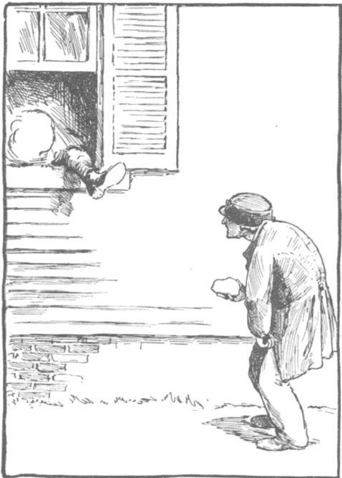
" A STURDY LEG EMERGING FROM HIS FRONT WINDOW."