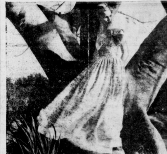
This printed rayon evening dress with a crossed ponche exposes a few inches of bare midriff.

Kentucky Epsilon chapter of Phi Delta Theta has purchased a house at 200 East Maxwell Street. The chapter will take possession August 10.