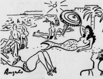
Illustration by the July issue of Esquire

Some cola drinks contain the same amount of caffeine as a cup of coffee plus four level teaspoons of sugar. Sugar is one of most readily available sources of energy. The habit is dangerous in the long run.