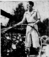
For easy living, working or playing, the knee-length seersucker shorts shown above are ideal. Topped with a comfortable battle jacket, the costume costs about $9.