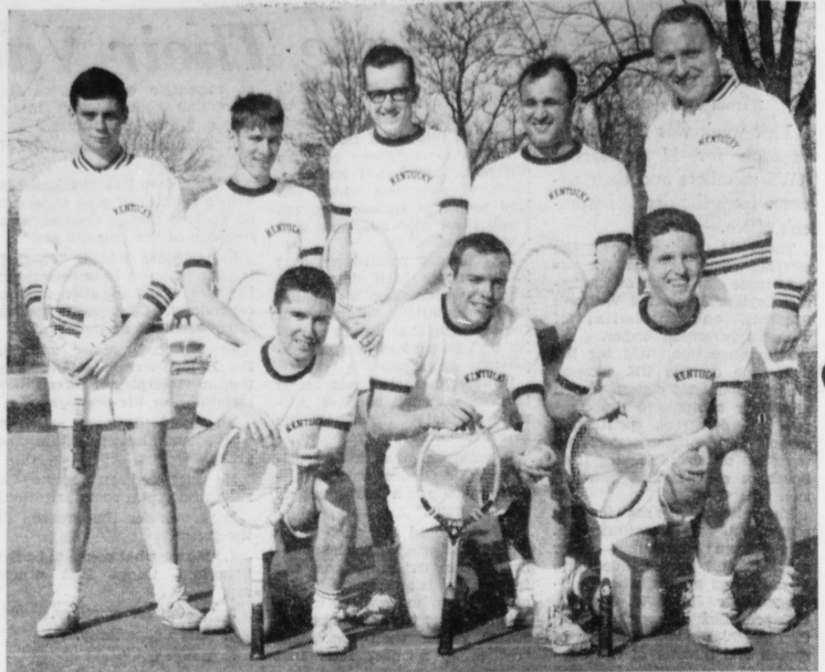
1964 Tennis Squad