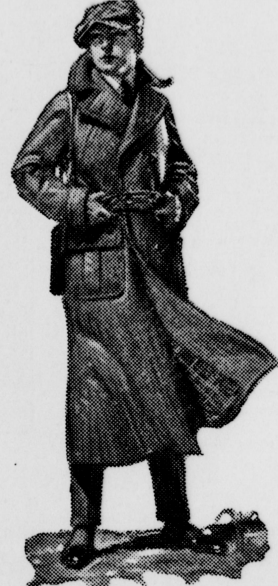
Copyright 1921 Hart Schaffner & Marx

features, and giving that clean sweet, indscrubably wholesome appearance which reveals personality, an artistic taste and whatnot. Think I'll look for one like that. Lastly bob head greets us. What? Well, What? It merely enables a girl to get by with a lot of stuff she wouldn't dare try otherwise. It is both horns of a dilemma. Watch out, ye matadors! There is nothing like hair except wool, its tickle, its beauty, its expression; it adds much to the art of love making and mating. There is nothing the average boy would rather do than to buy hair nets for a girl. "None of you boys will be presidents; you're too good looking." Isn't that just like a girl, spent three hours pulling her eyebrows out to get that line and then wear yellow stockings and we don't even get to her chin.