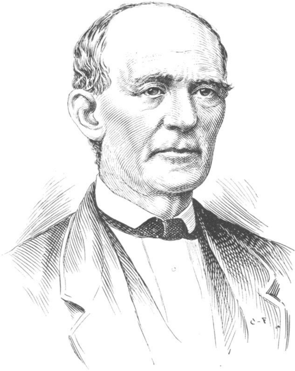
WILLIAM H. MCGUFFEY