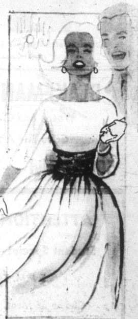
Full-bloomy skirt in soft WHITE wool jersey wrapped tightly at the waist in bright pleated paisley . . . $25.00.