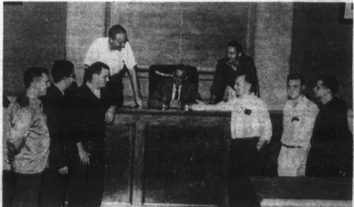
Not Guilty Your Honor