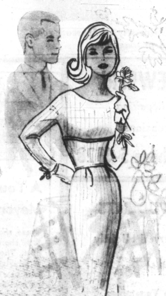
Long-sleeved clingy WHITE wool knit sheath for a lady-like siren at luncheon . . . and on . . . $25.00.