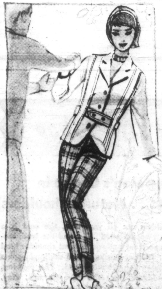
Resourceful WHITE wool jacket cut Norfolk style . . . $29.95. For all your skirts, or, as here, with woman-tailored pants . . . $17.95.