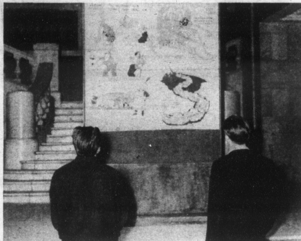
Russian students at the University of Moscow read anti-American propaganda.

But we think the demerits overrule the merits and that the new arrangement should be outlawed.